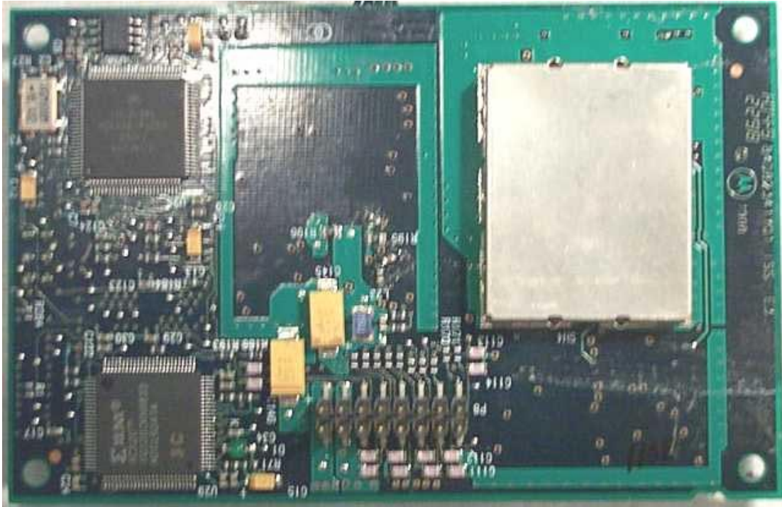
Figure 3.0-2 Transceiver PCB back view