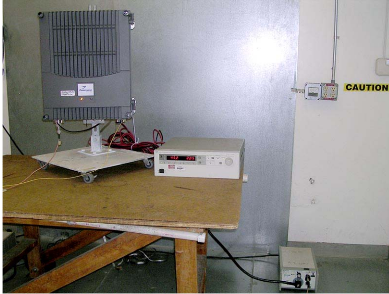
cond en fr-dc