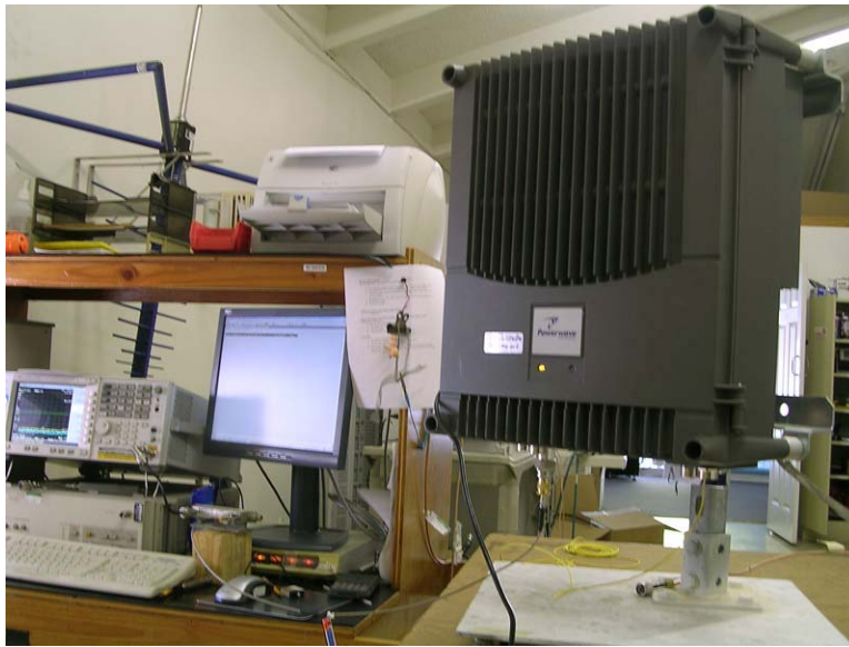
cond em ant