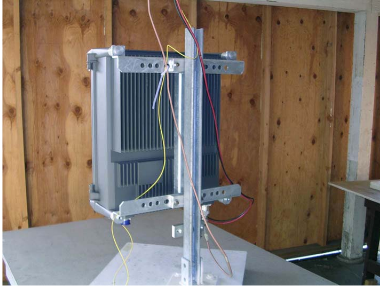
rad em bk dc