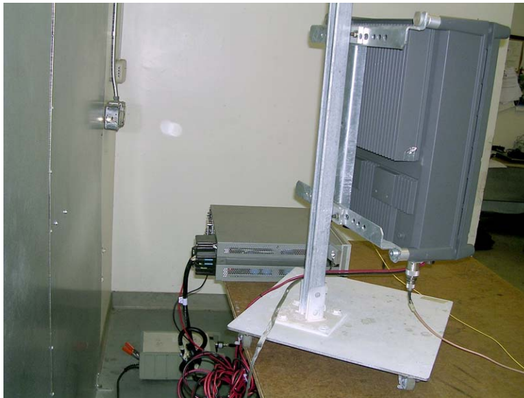
cond en bk-dc