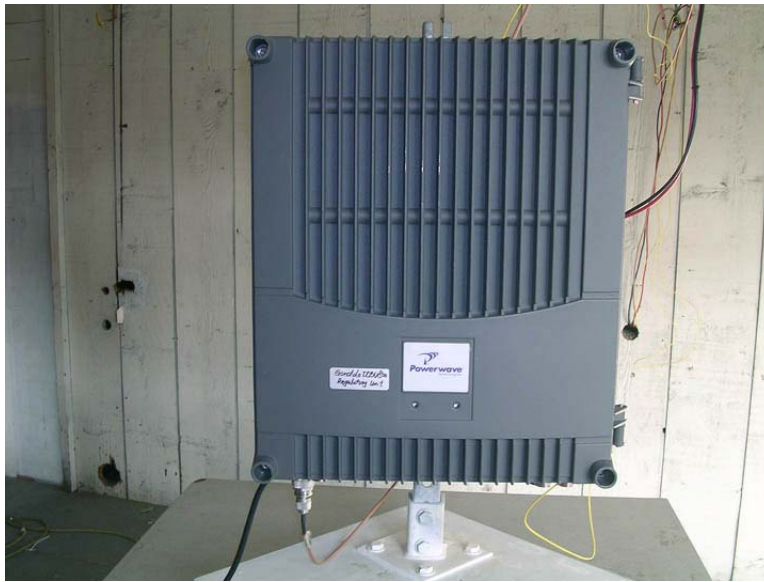
rad em fr ac