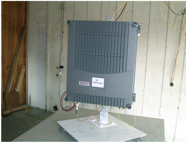
rad em fr dc