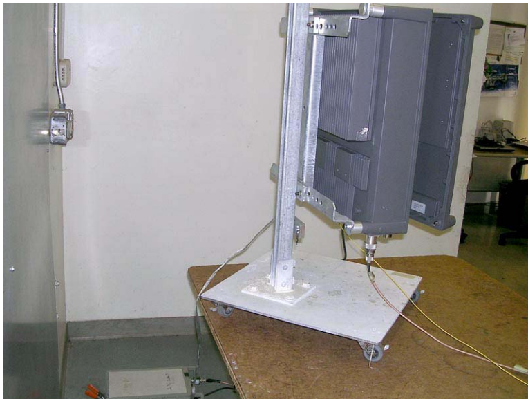
cond em bk ac