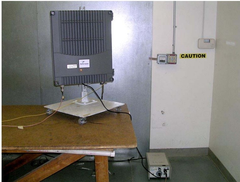
cond em fr ac