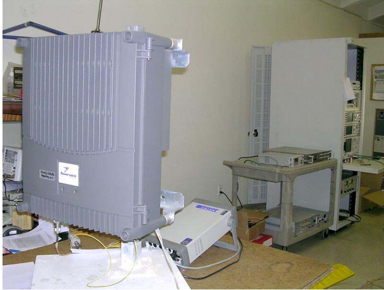
cond em _gain linear