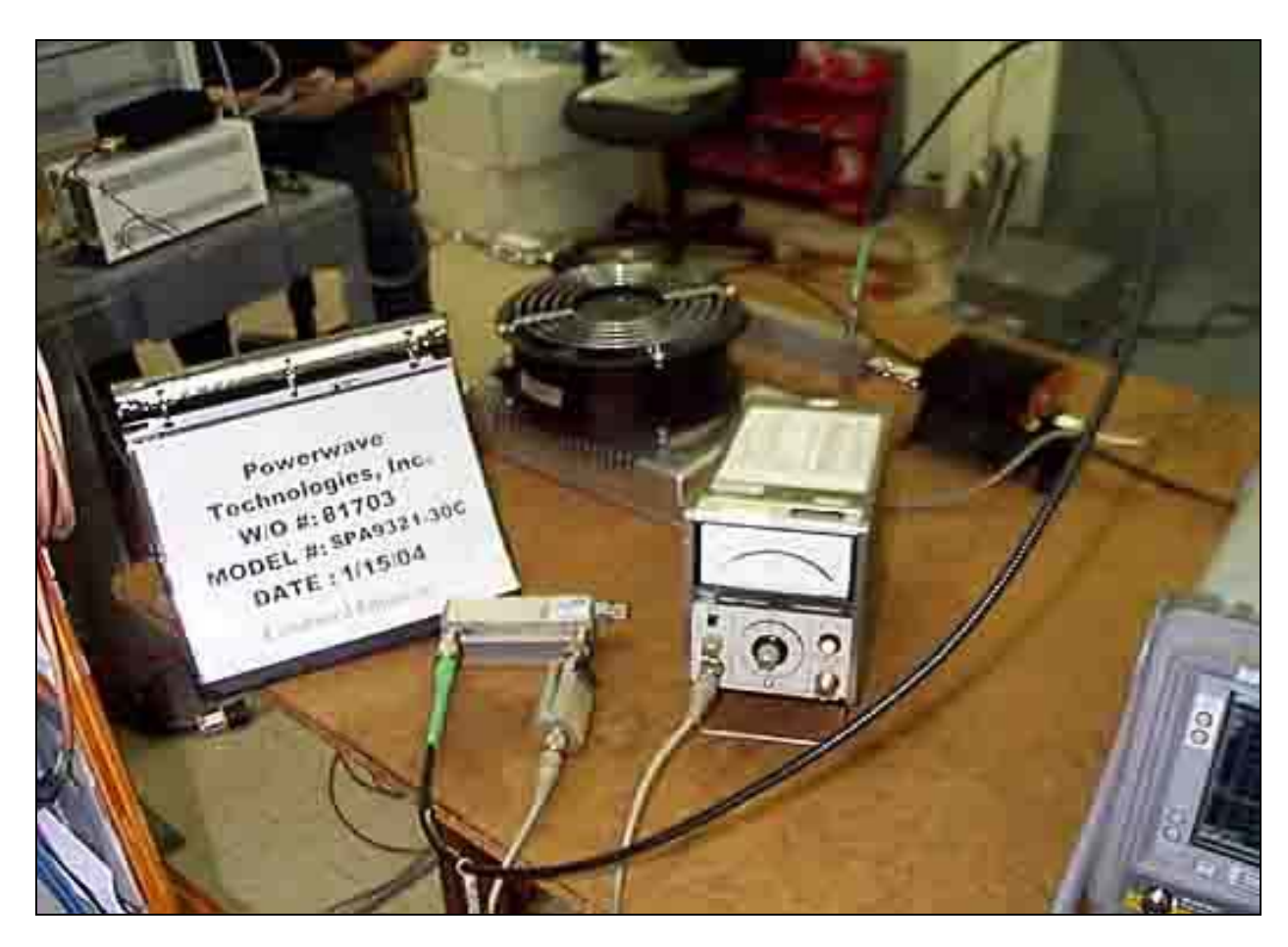
24.232 RF Power Output