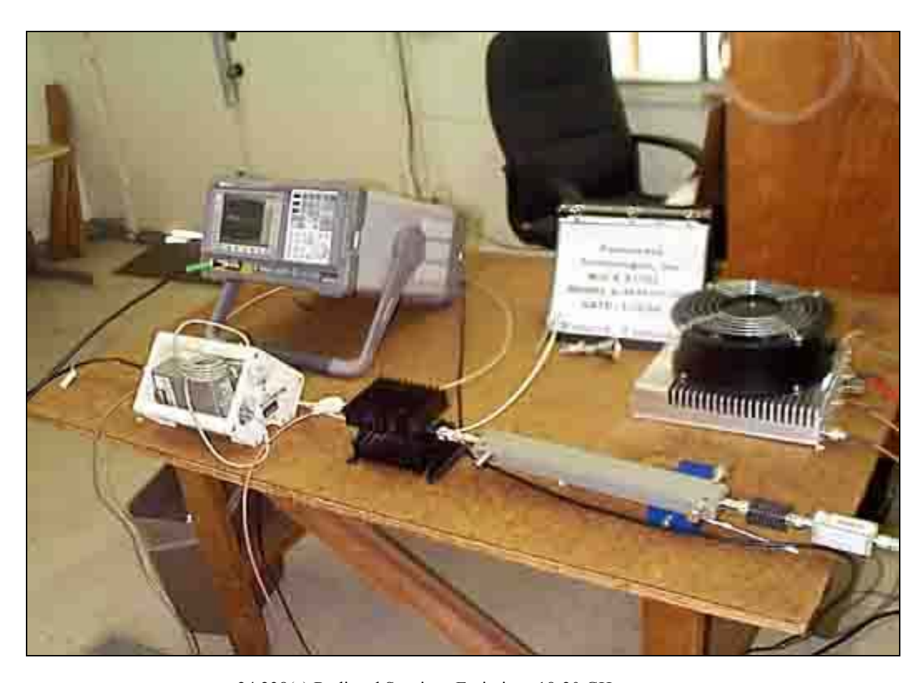
24.238(a) Radiated Spurious Emissions 18-20 GHz