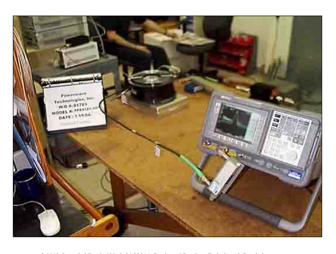
2.1049 Occupied Bandwidth & 24.238(a) Conducted Spurious Emissions & Bandedge