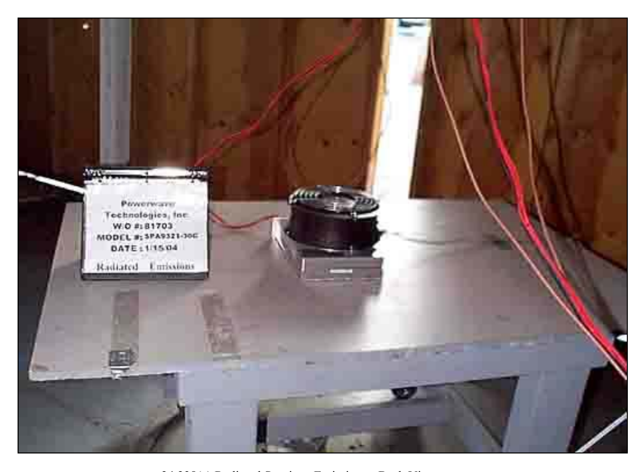
24.238(a) Radiated Spurious Emissions - Back View