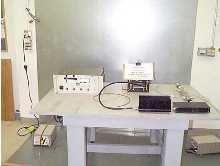
PHOTOGRAPH SHOWING MAINS CONDUCTED EMISSIONS