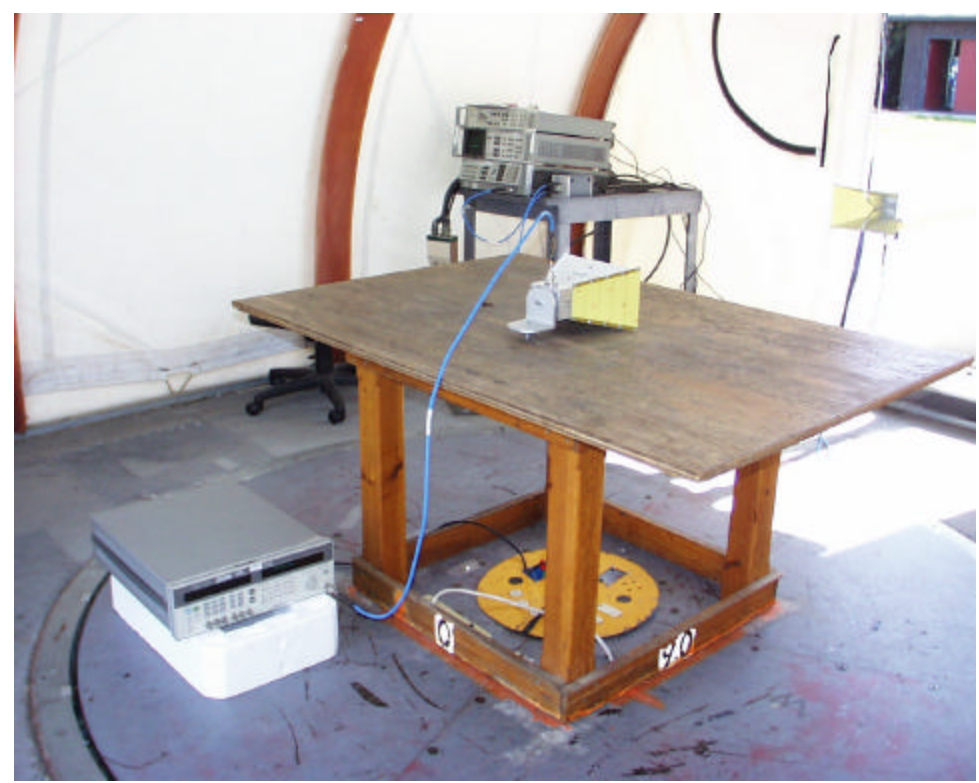
Substitution Method Setup