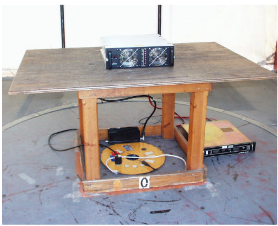
Part15 front view Radiated Emission Setup