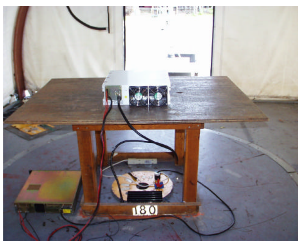
Part15 back view Radiated Emission Setup