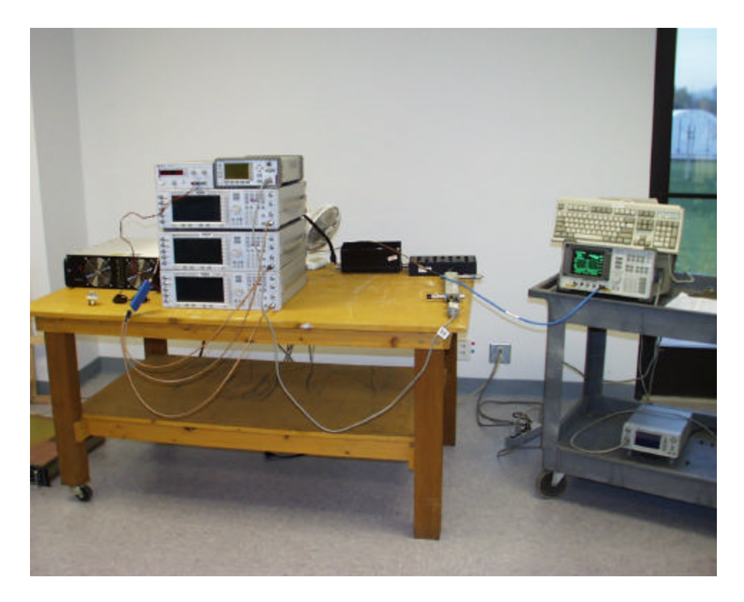
Occupied Bandwidth Input Setup