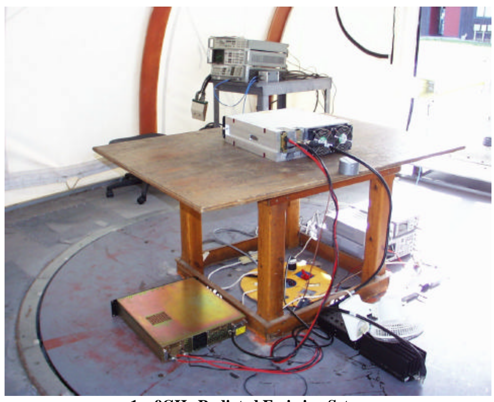
1 – 9GHz Radiated Emission Setup