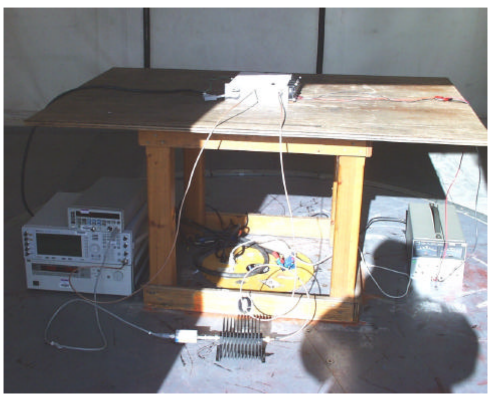
Part15 front view Radiated Emission Setup