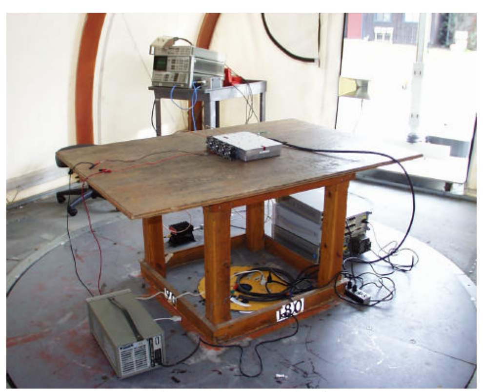
1 – 9GHz Radiated Emission Setup