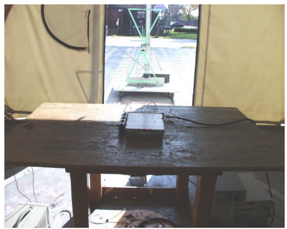
Part15 back view Radiated Emission Setup