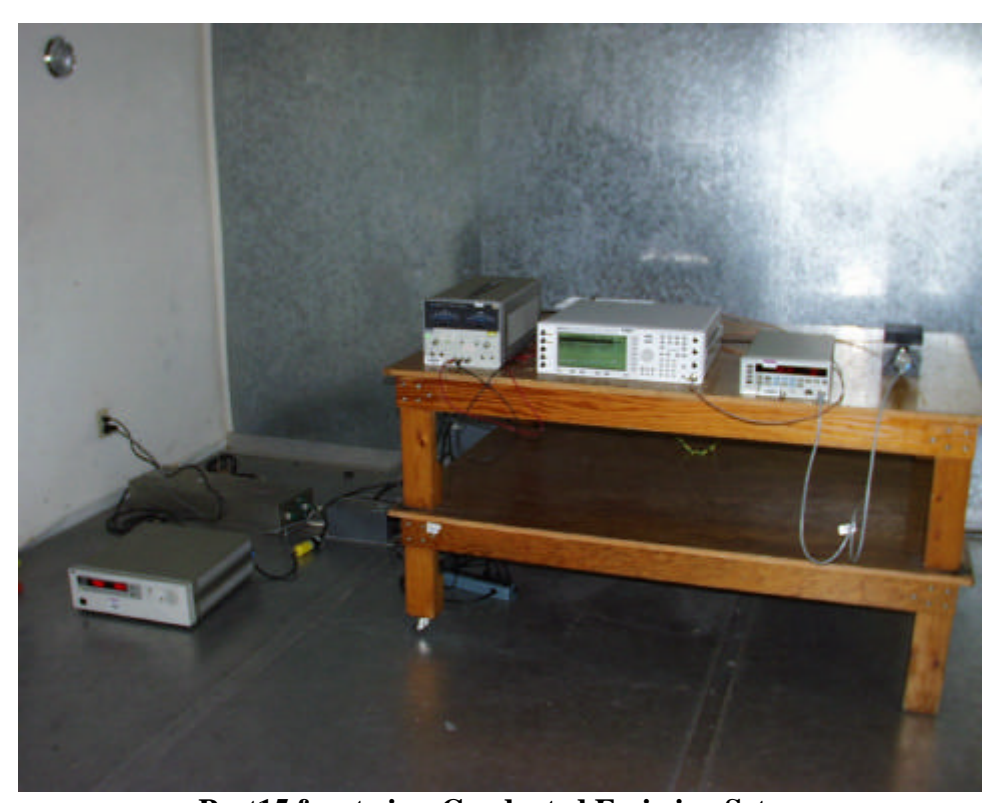
Part15 front view Conducted Emission Setup