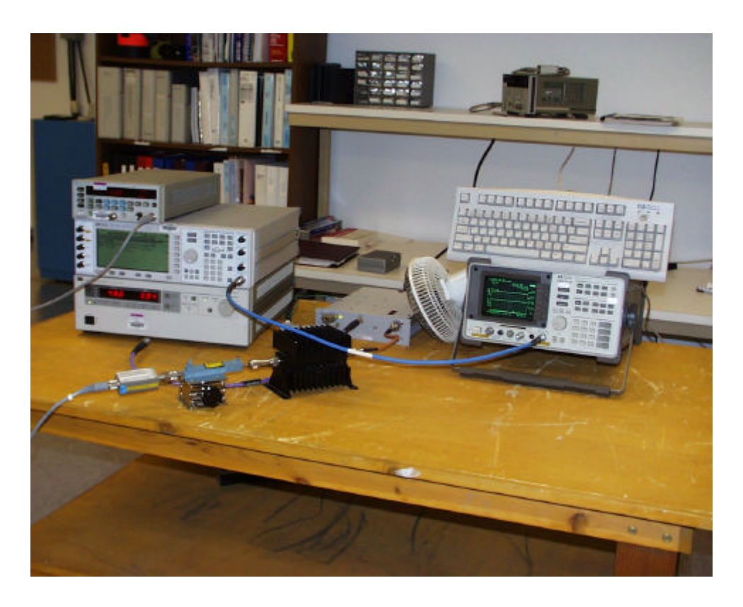
Occupied Bandwidth Input Setup