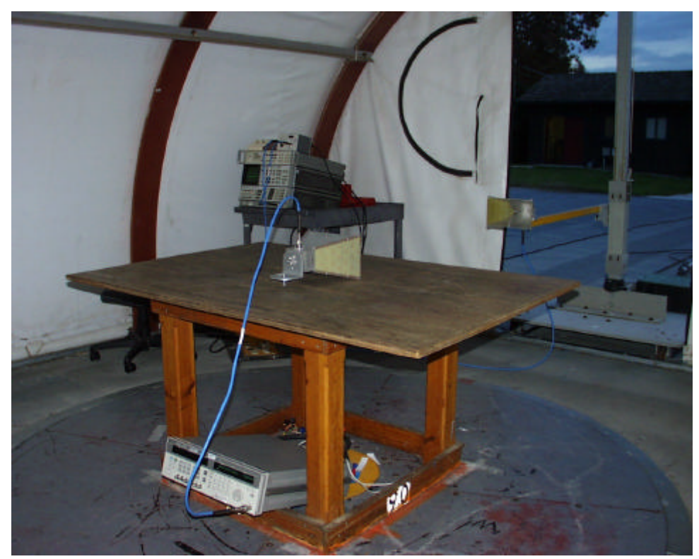
Substitution Method Setup