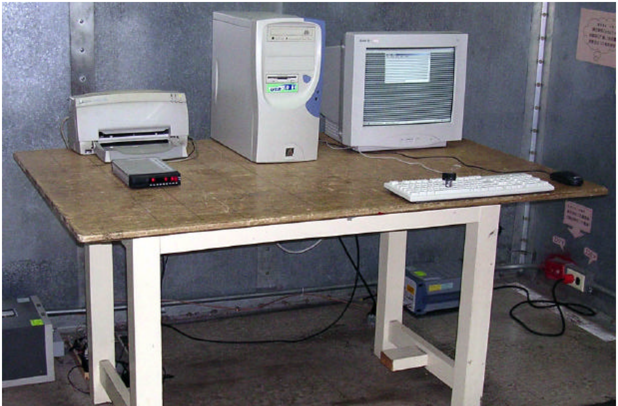
The Front View of Highest Conducted Set-up For EUT