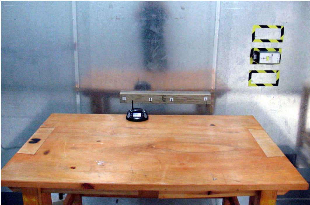
The Front View of Highest Conducted Set-up For EUT