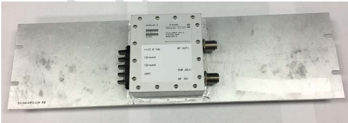
GPA-9 standard heat-sink option