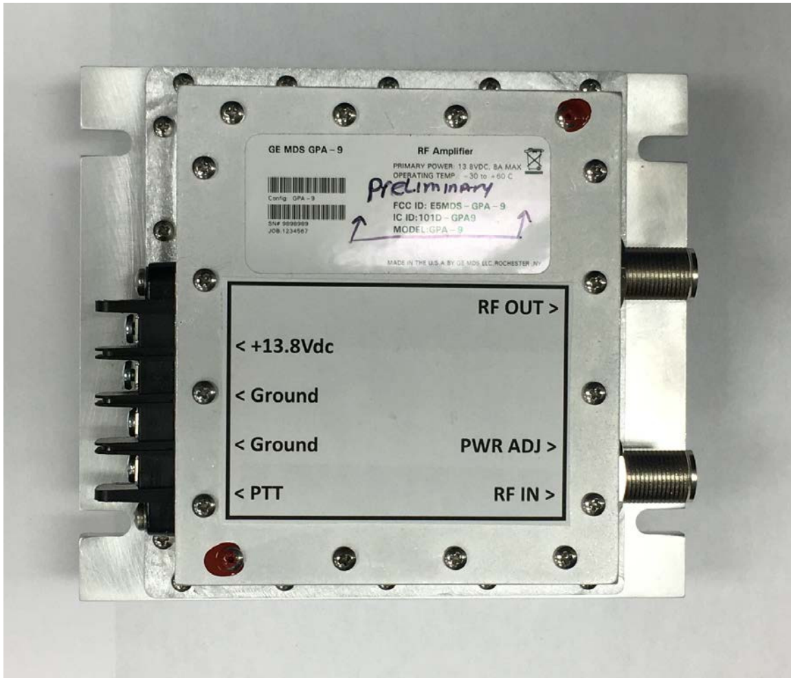
GPA-9B smaller heat-sink option