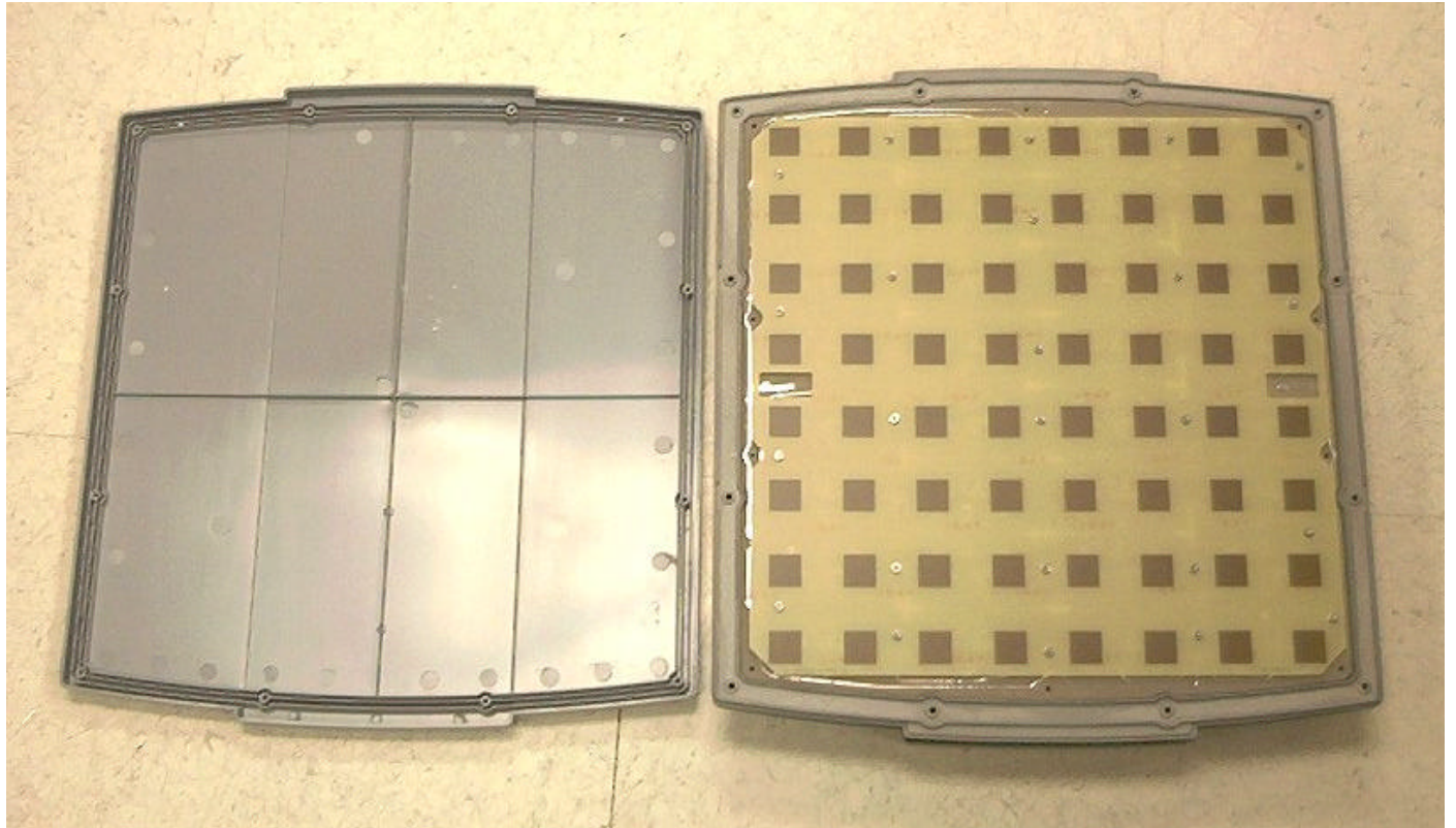
Internal Photo of External Antenna