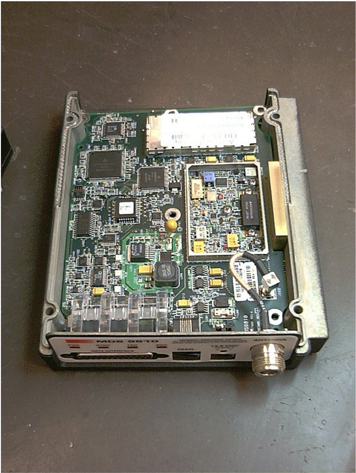
9810 PCB Covers off