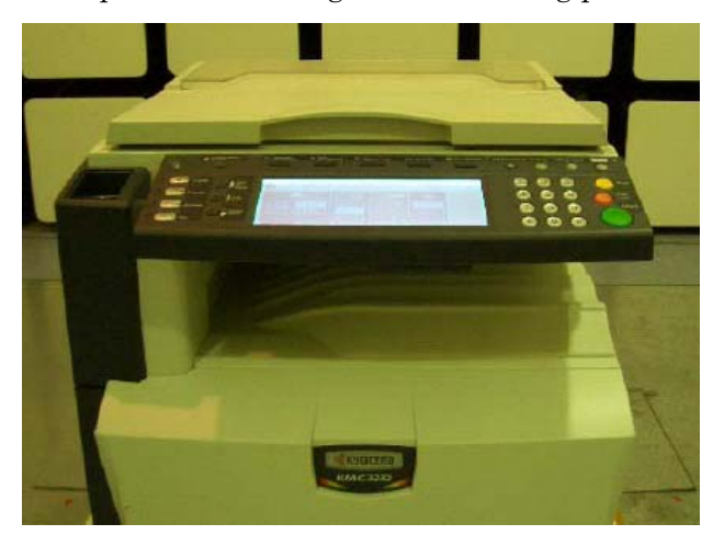
Overview of printer

B5J\mbox{-}0452 is attached in printer according to the following photo 1 and 2.