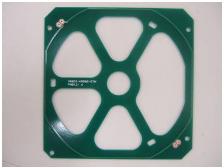
Fig. 9 V680S-HMD66-ETN PWB(2) Side A