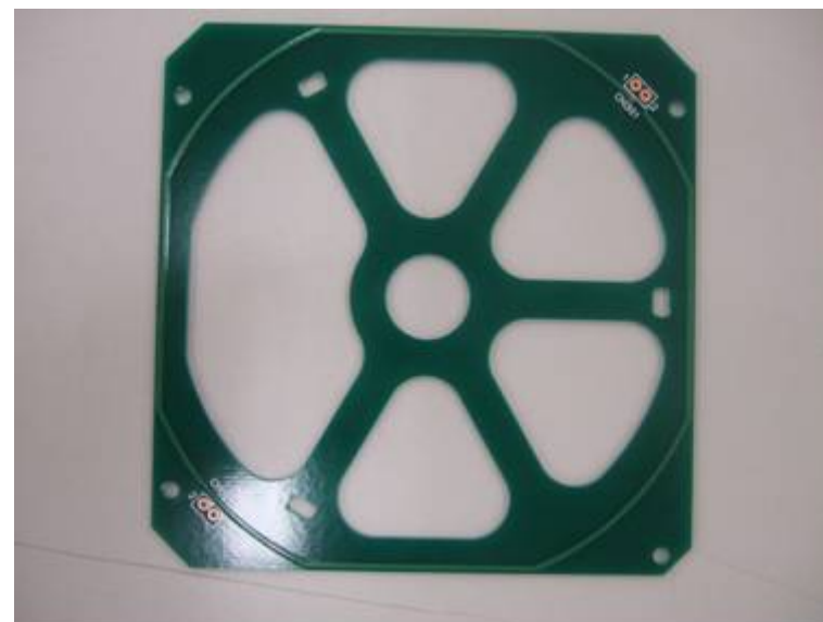
Fig. 10 V680S-HMD66-ETN PWB(2) Side B