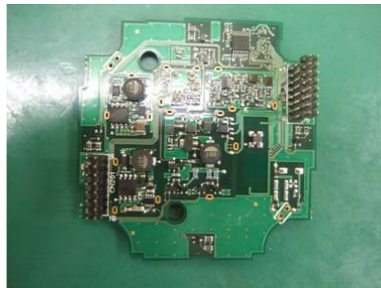
Fig. 9 V680S-HMD64-ETN PWB(2) Side B