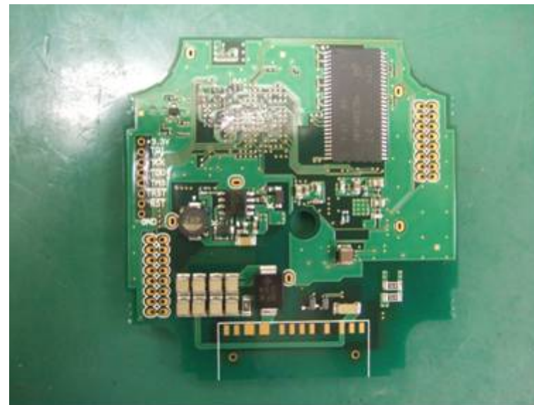
Fig. 7 V680S-HMD64-ETN PCB(1) Side B