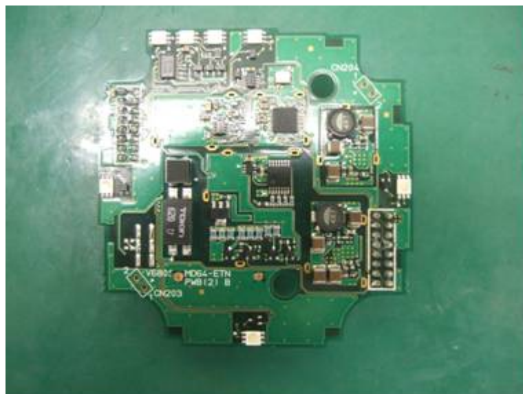
Fig. 8 V680S-HMD64-ETN PWB(2) Side A