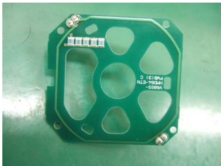
Fig. 10 V680S-HMD64-ETN PWB(3) Side A