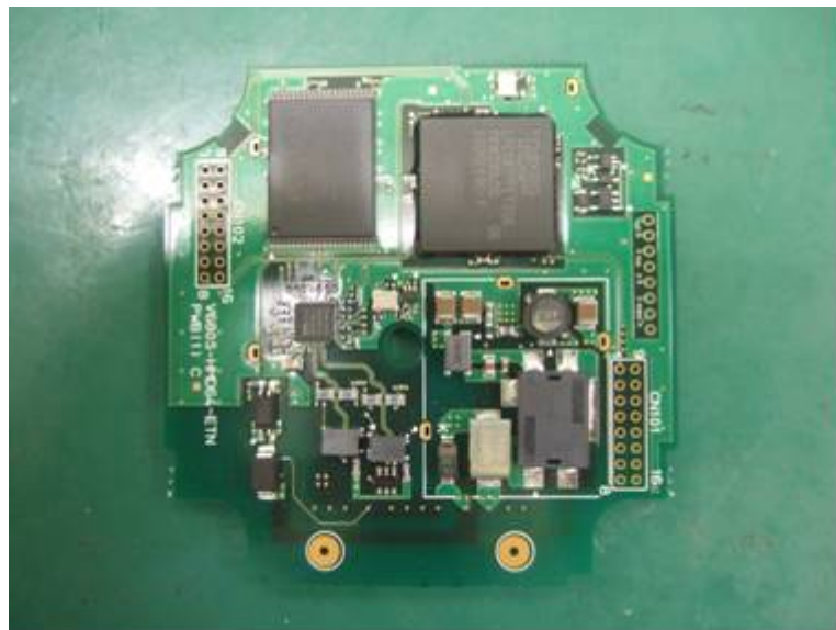
Fig. 6 V680S-HMD64-ETN PCB(1) Side A