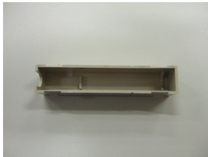
Case inside View