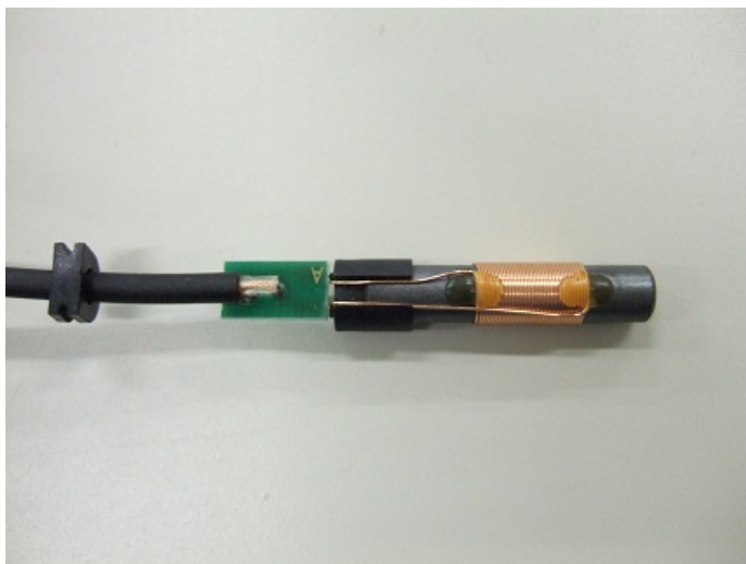
PCB Side A