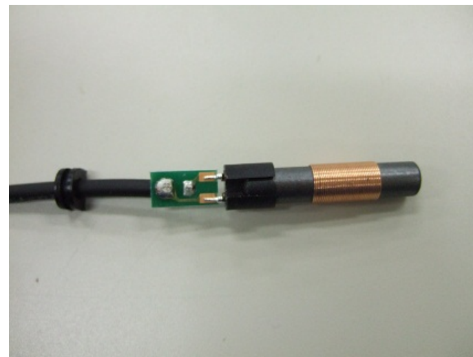
PCB Side B