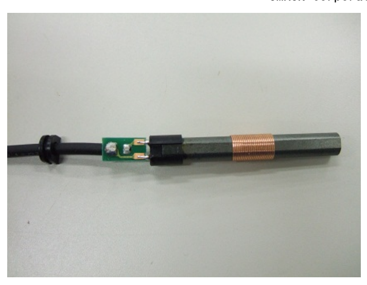
PCB Side B