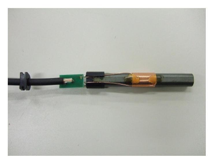
PCB Side A