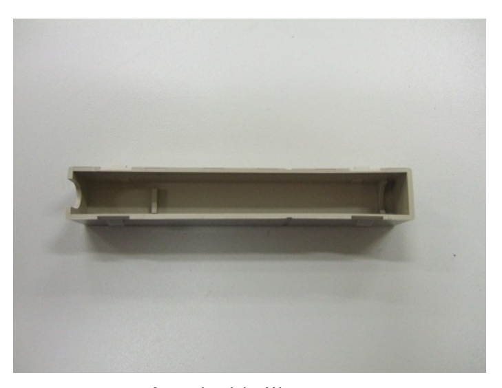
Case inside View