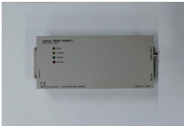
Fig. 1 Front View