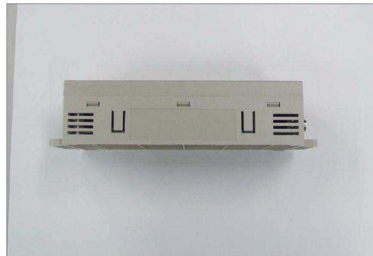
Fig. 6 Bottom View