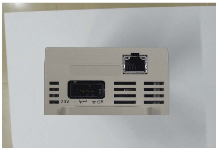
Fig. 3 Left Side View