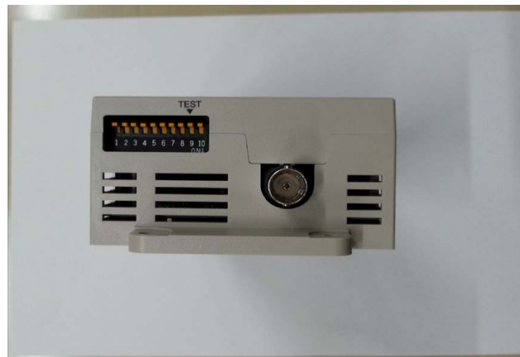
Fig. 4 Right Side View