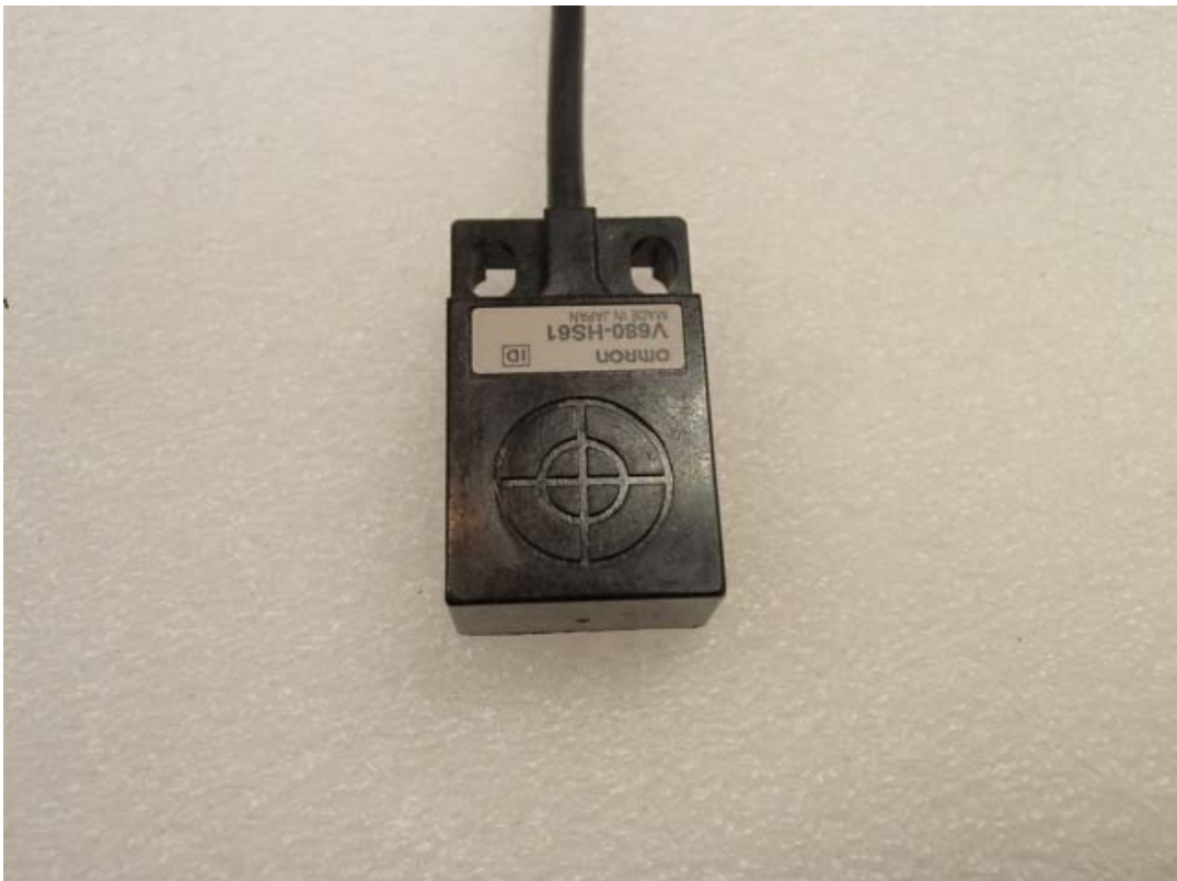
Without Tag (Worst)