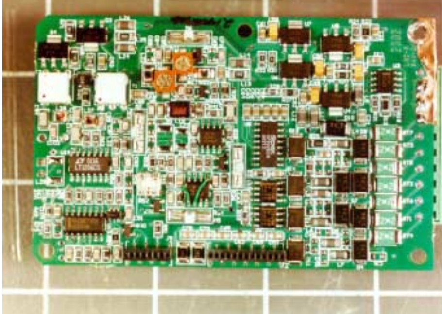
Bottom Main PCB