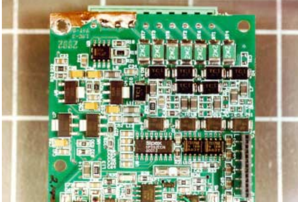
Bottom Main PCB #1 close-up