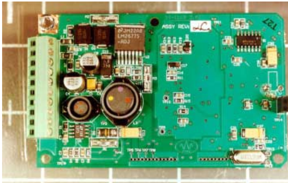
Bop Main PCB without shield over power supply