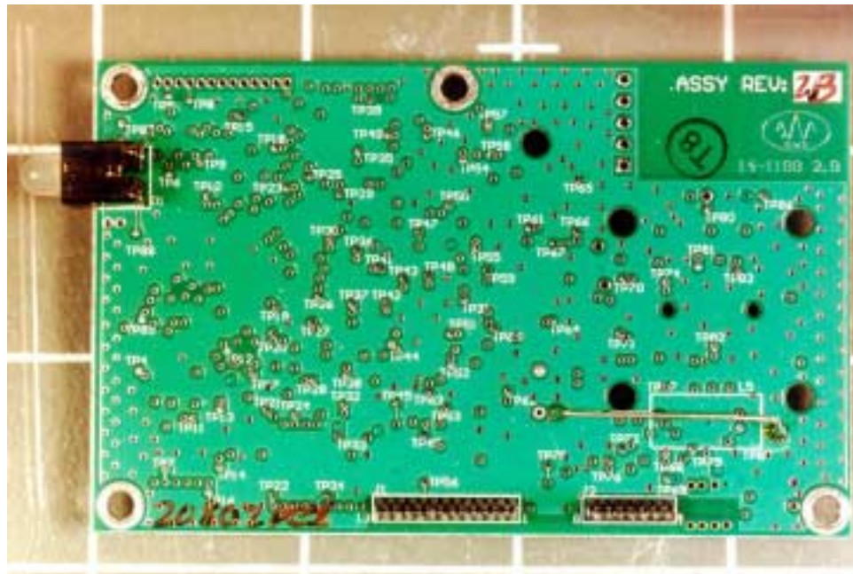
Top Daughter PCB