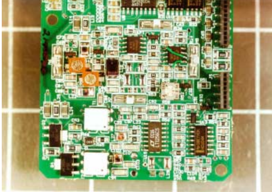
Bottom Main PCB #2 close-up