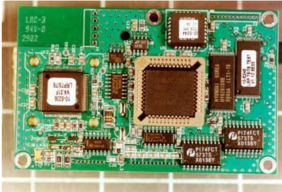
Bottom Daughter PCB