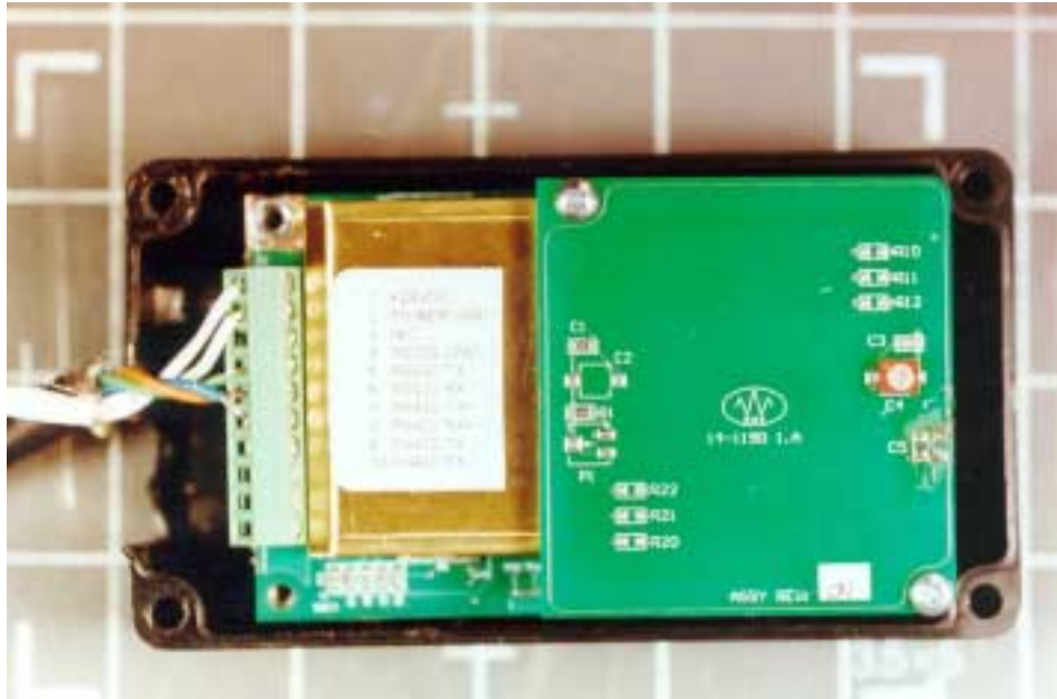
Inside Front Cover