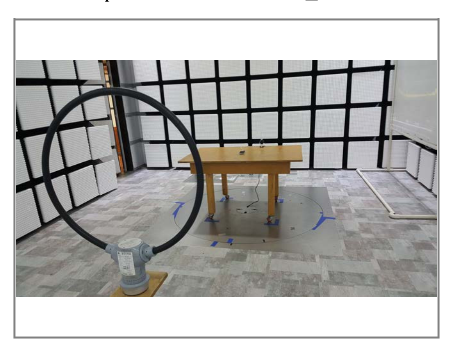
Photo of radiated spurious emission at 30 \square\, ~ 1 000 \square\,

Photo of radiated spurious emission at below 30 \square