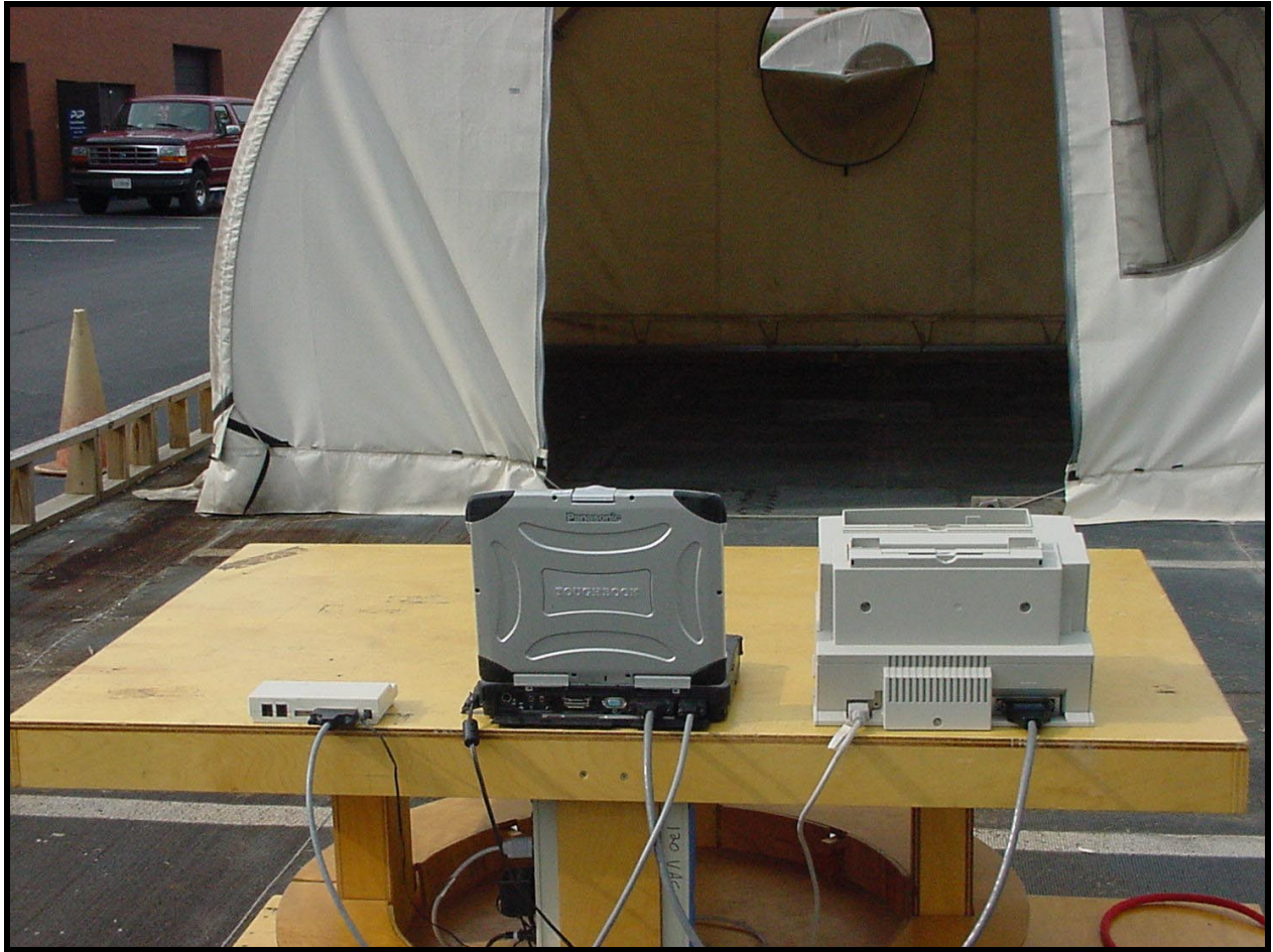
PHOTOGRAPH 4: RADIATED EMISSION REAR VIEW - WORST CASE CONFIGURATION