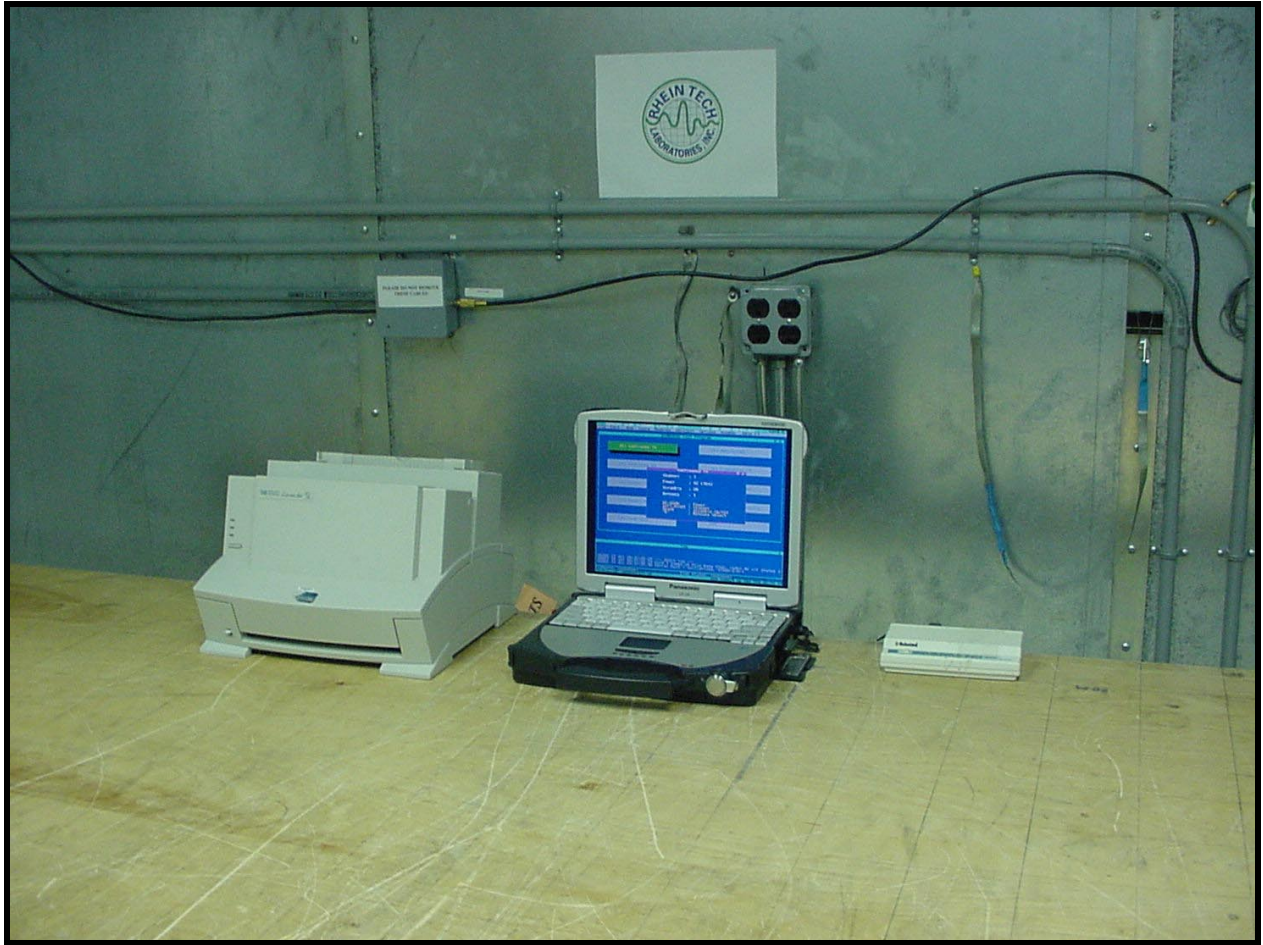
PHOTOGRAPH 5: CONDUCTED EMISSION FRONT VIEW