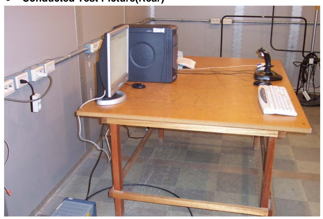
Samsung Electro-Mechanics Co., Ltd. FCC ID:E2XSDR5000R