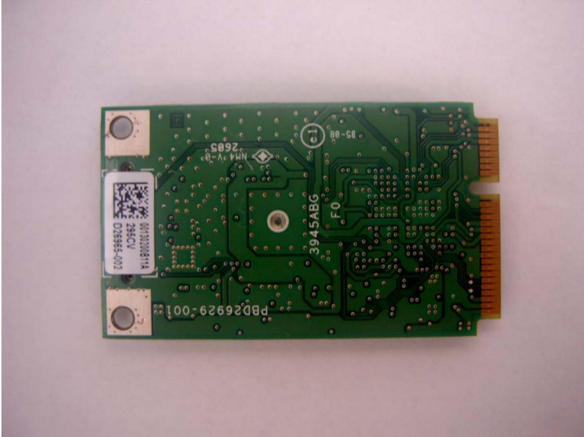
Bottom View “Insulation removed”