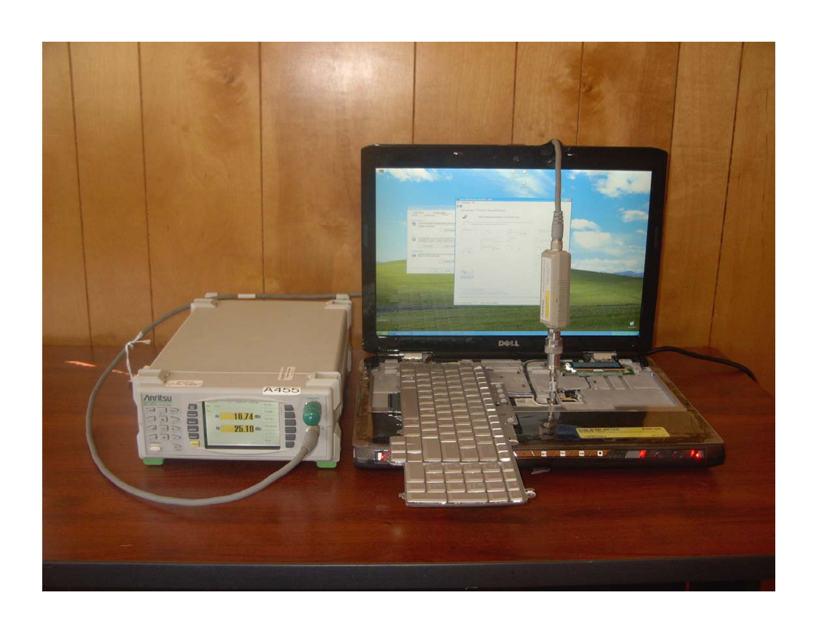
Maximum Peak Output Power Measurement Setup