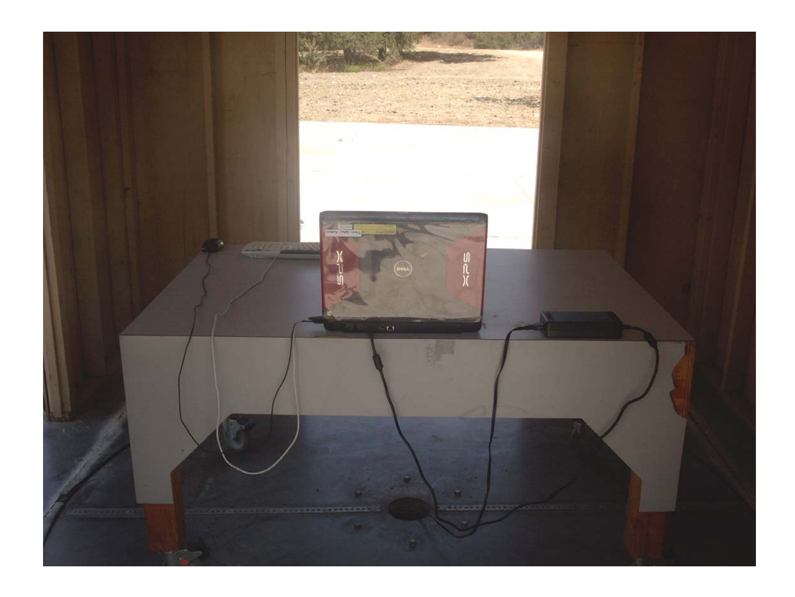
Radiated Emissions Measurement (Rear View) Setup