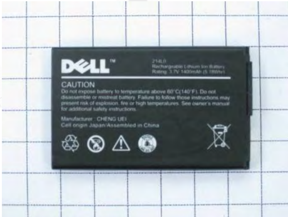
Fig.5 Front view of Battery