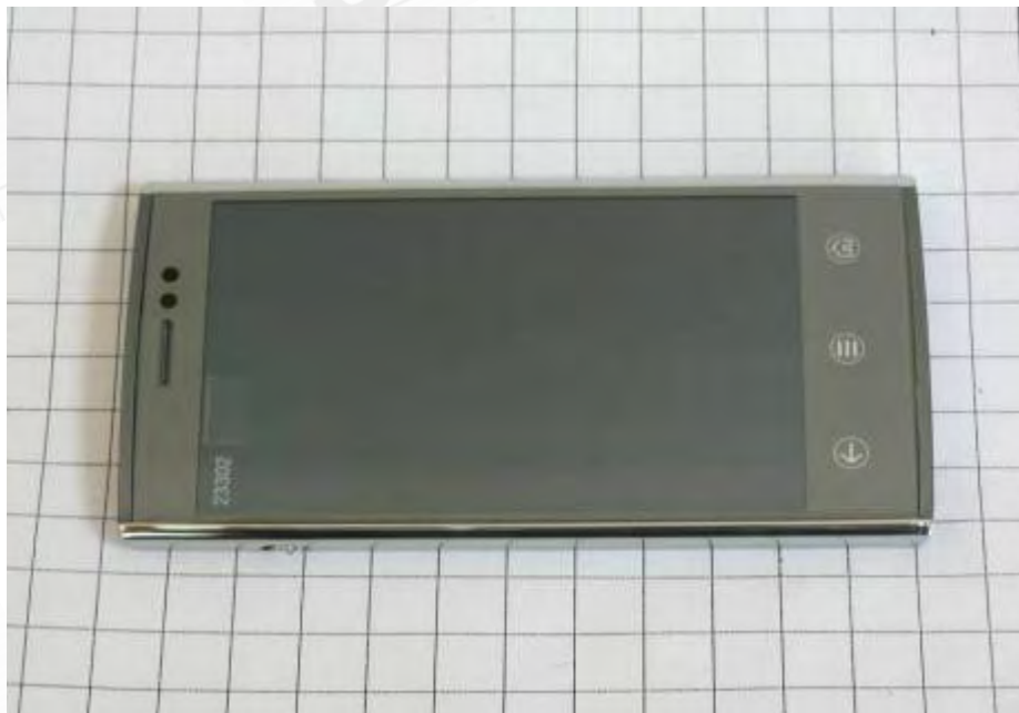
Fig.3 Front view of device