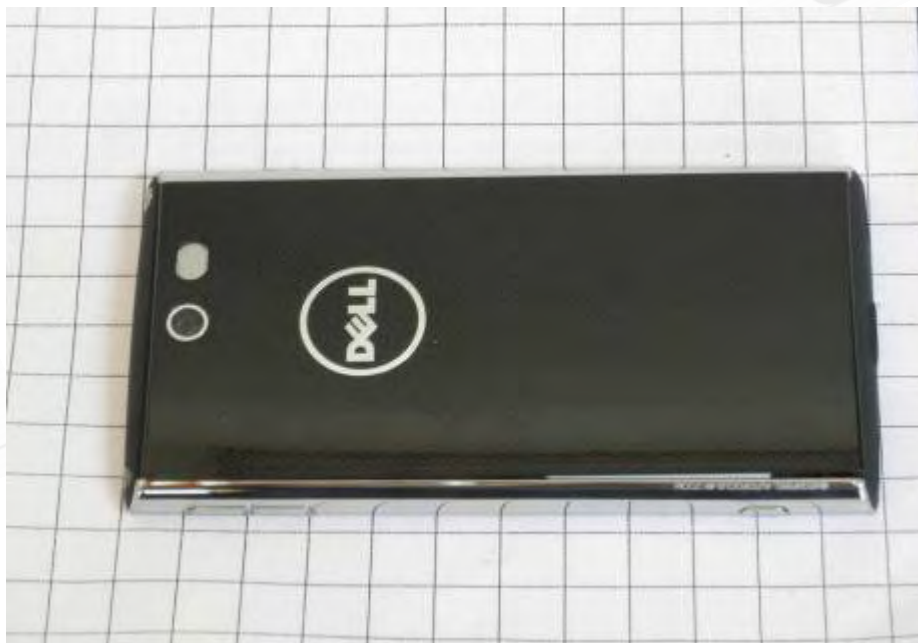
Fig.4 Back view of device

Unless otherwise stated the results shown in this test report refer only to the sample(s) tested and such sample(s) are retained for 90 days only. 除非另有說明，此報告結果僅對測試之樣品負責，同時此樣品僅保留 90 天。本報告未經本公司書面許可，不可部份複製。