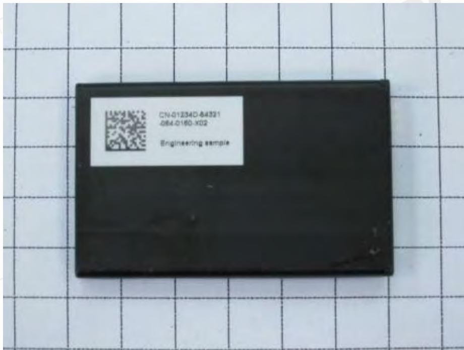
Fig.6 Back view of Battery