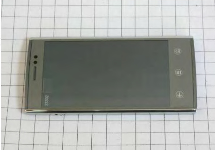
Fig.3 Front view of device