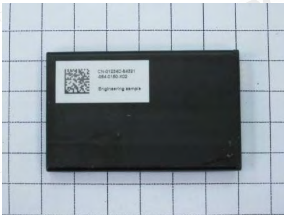
Fig.6 Back view of Battery