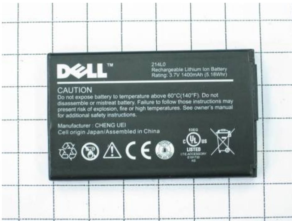
Fig.7 Front view of Battery