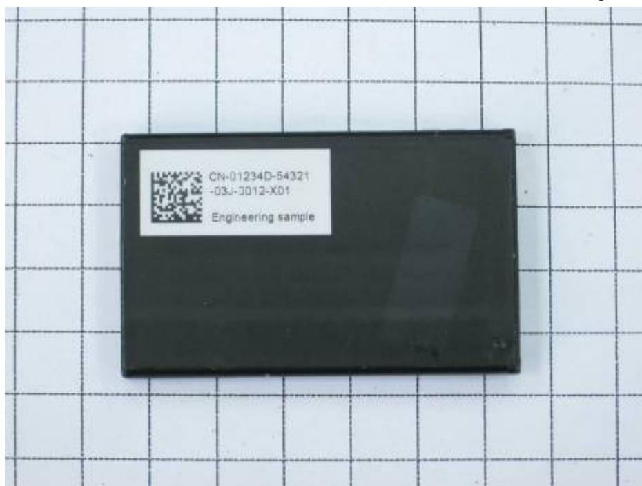
Fig.8 Back view of Battery