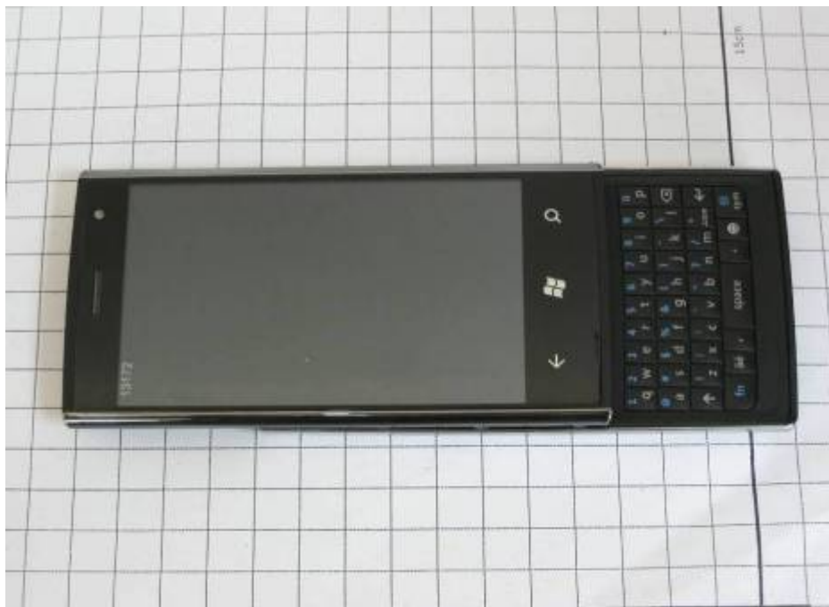
Fig 5 Front view of device(Slider on)