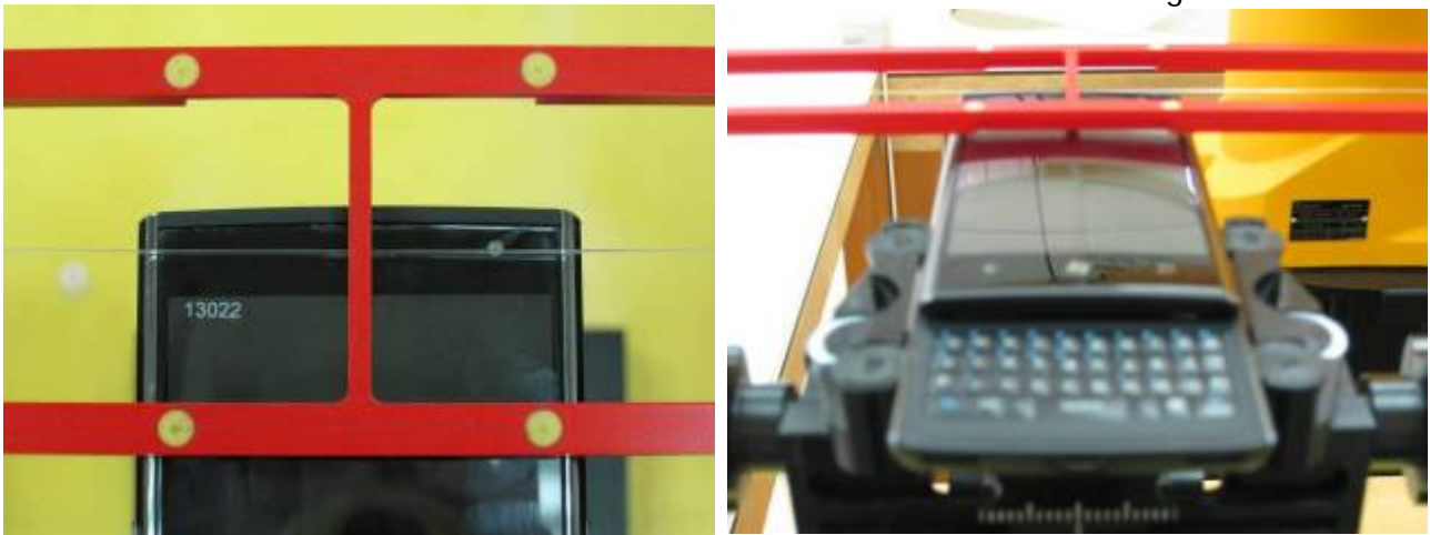
Fig.3 Receiver of mobile contact center of Arch. (Slider on)