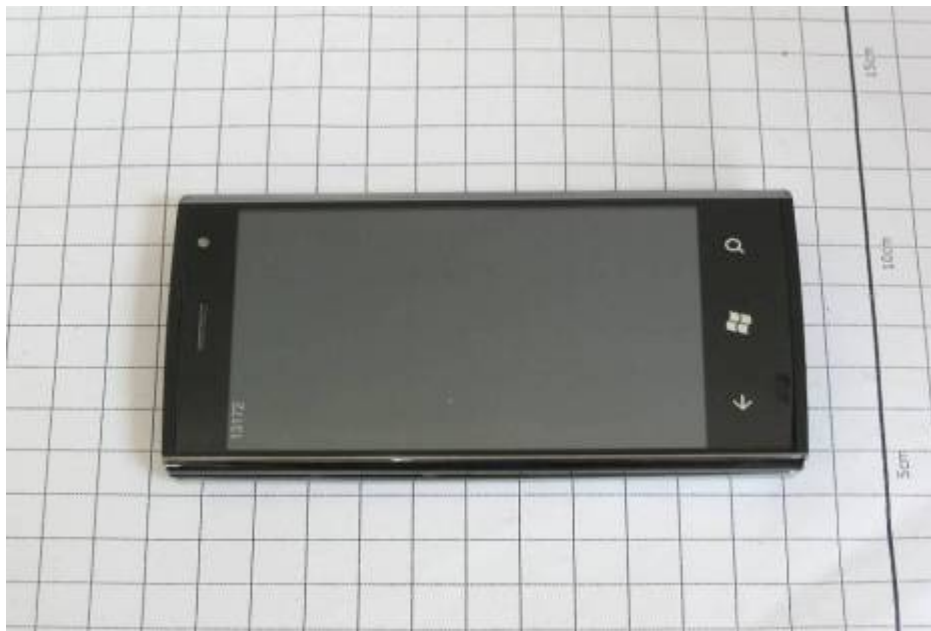
Fig.4 Front view of device (Slider off)