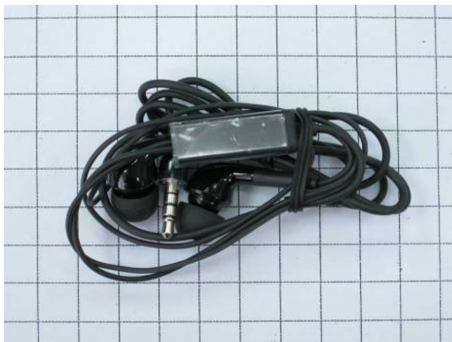
Fig.9 Headset (PCH)