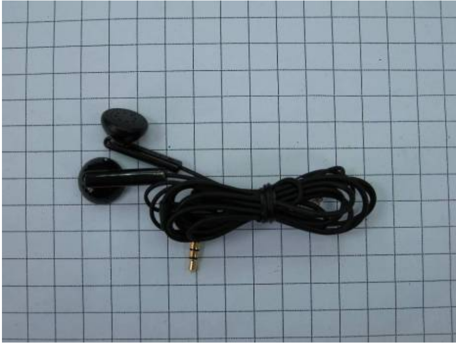
Fig.10 Headset (Foster)