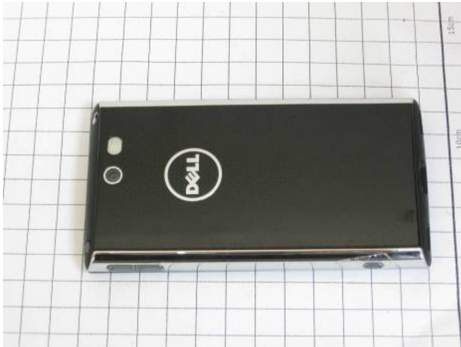
Fig.6 Back view of device