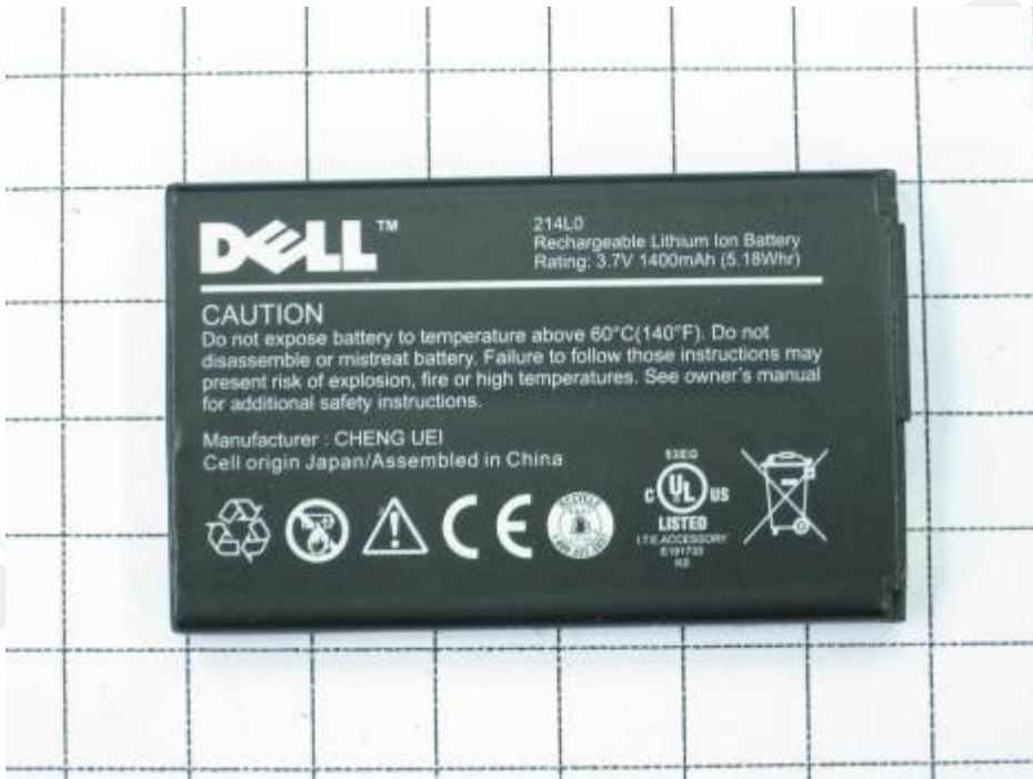
Fig.7 Front view of Battery

Unless otherwise stated the results shown in this test report refer only to the sample(s) tested and such sample(s) are retained for 90 days only. 除非另有說明，此報告結果僅對測試之樣品負責，同時此樣品僅保留90天。本報告未經本公司書面許可，不可部份複製。