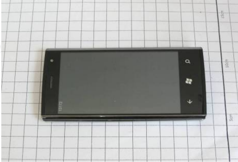
Fig.4 Front view of device (Slider off)