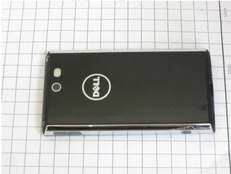
Fig.6 Back view of device