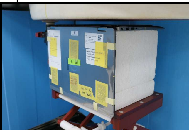
Bottom of EUT Tested at 17 mm