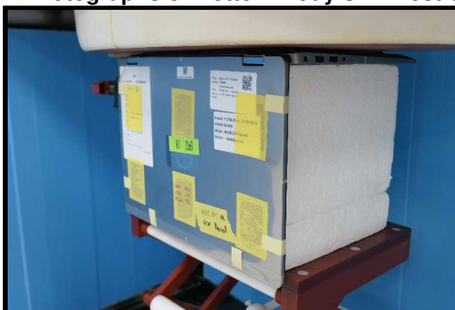
Bottom of EUT Tested at 0 mm