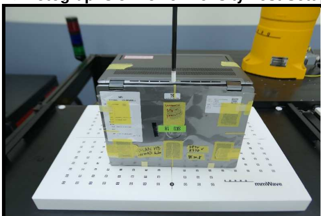
Bottom of EUT Tested at 0 mm