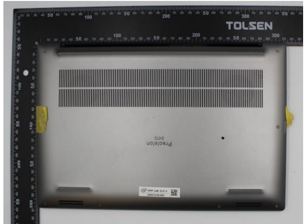
Laptop Sample 230210-09.S02