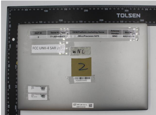
Back Sample 230210-09.S02