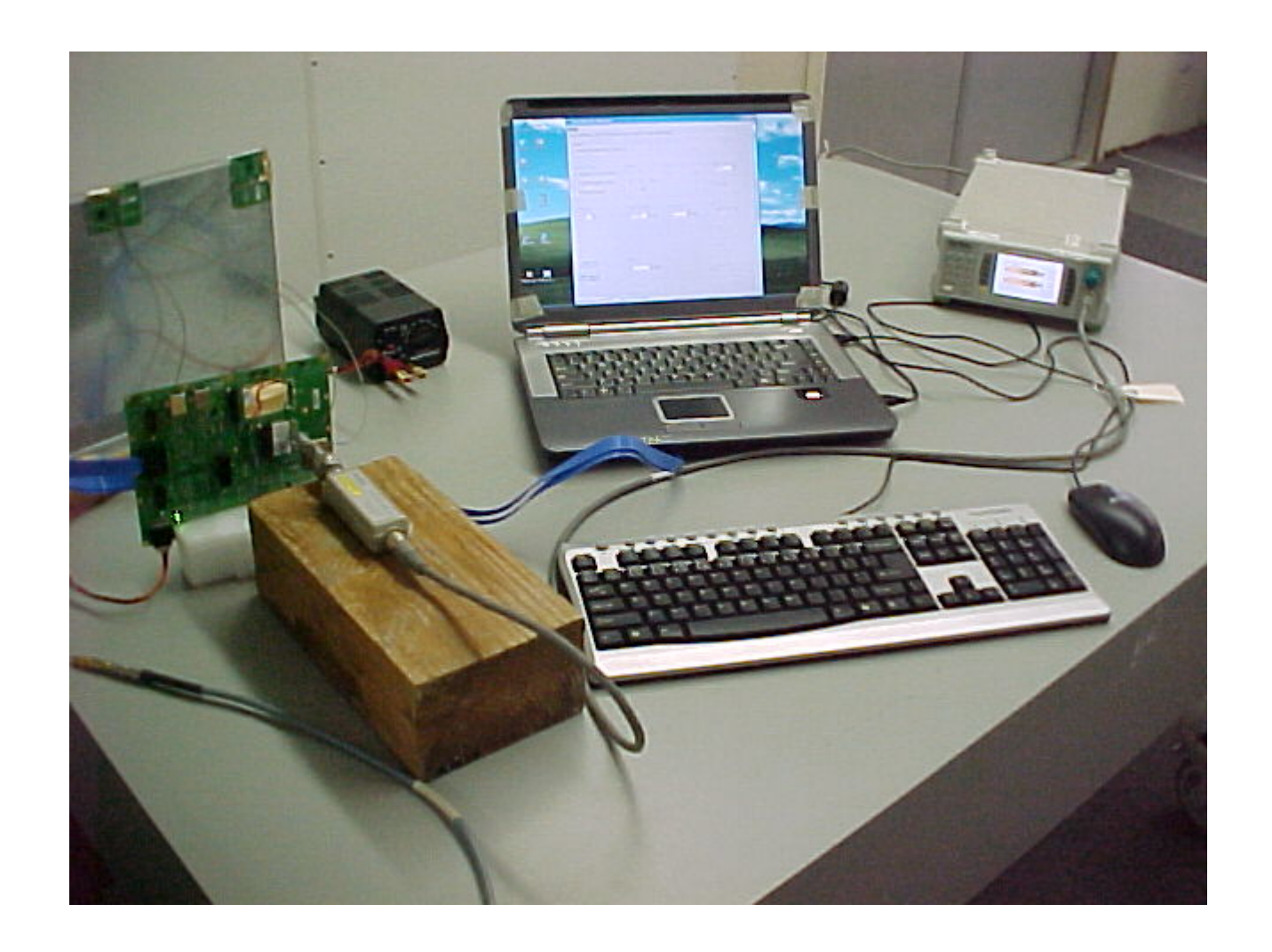
Maximum Peak Output Power Measurement Setup