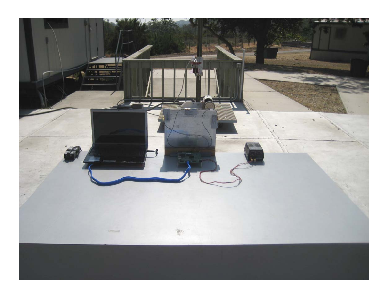
Radiated Emissions Measurement (Front View)