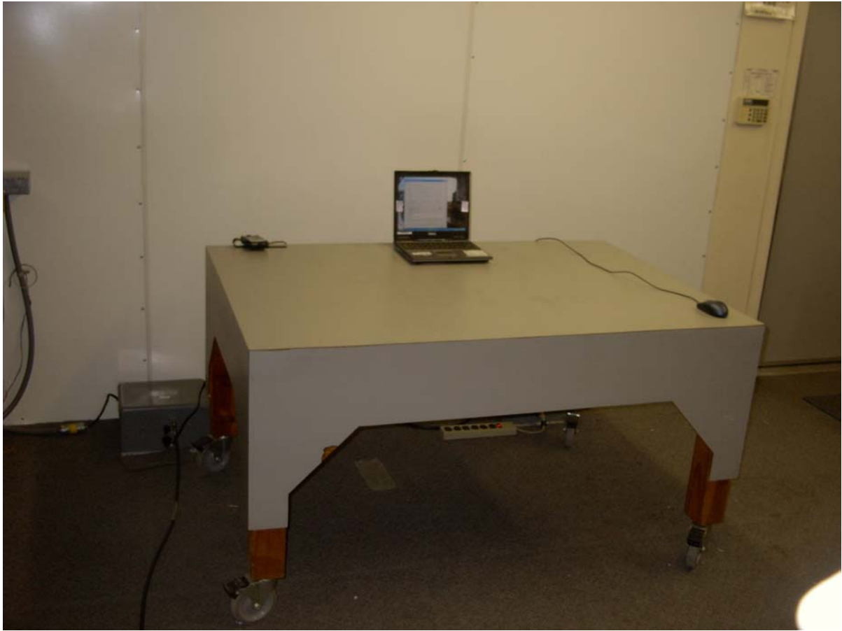
AC Conducted Emissions Measurement (Front View) Setup