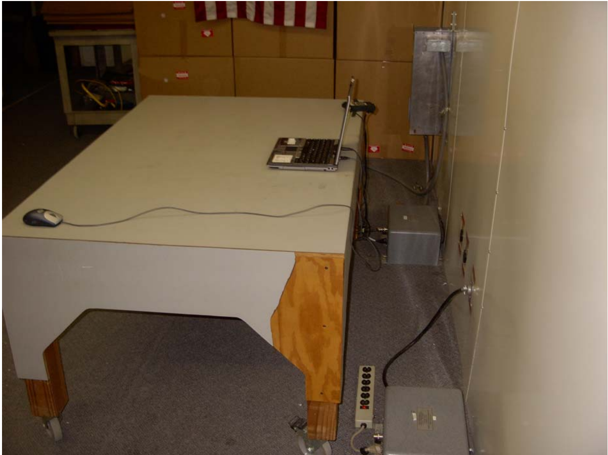
AC Conducted Emissions Measurement (Rear View) Setup