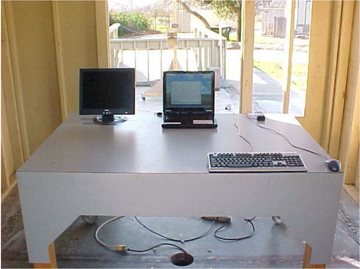
Radiated Emissions Measurement (Front View) Setup