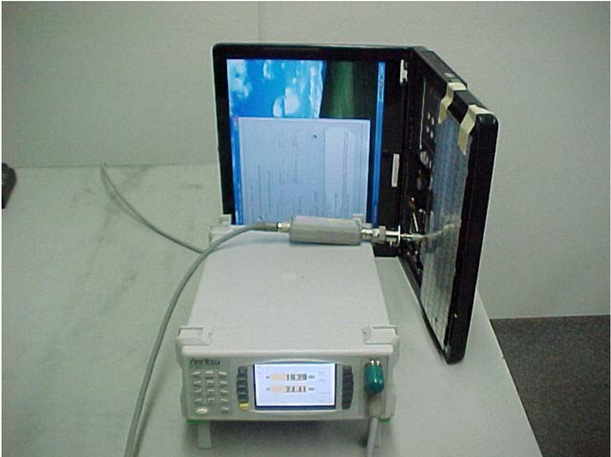
Maximum Peak Output Power Measurement Setup