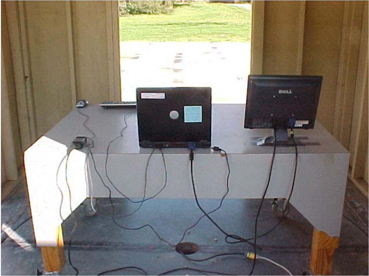
Radiated Emissions Measurement (Rear View) Setup