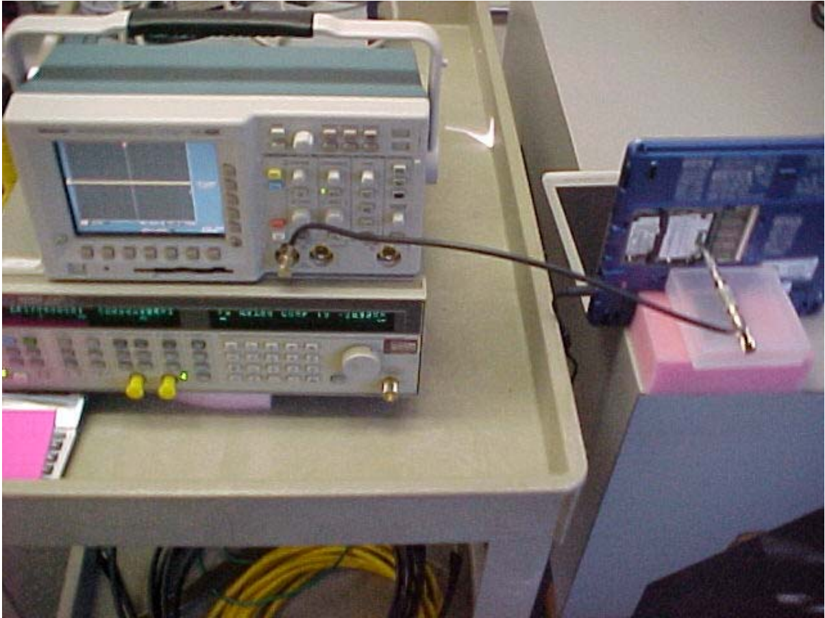
Maximum Peak Output Power Measurement Setup