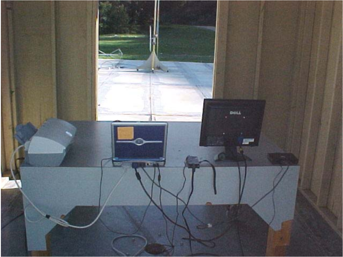
Radiated Emissions Measurement (30-1000 MHz) (Rear View) Setup