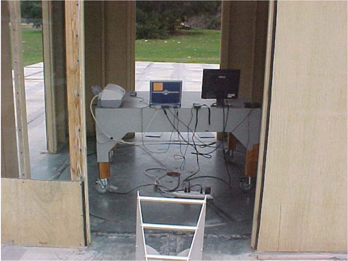
Radiated Emissions Measurement (1-26.5 GHz) (Rear View) Setup