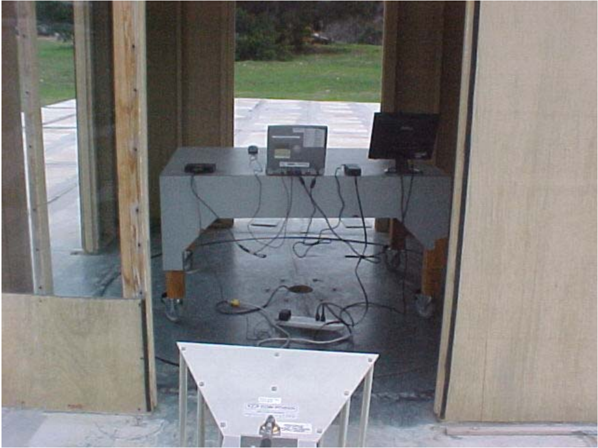
Radiated Emissions Measurement (1-26.5 GHz) (Rear View) Setup