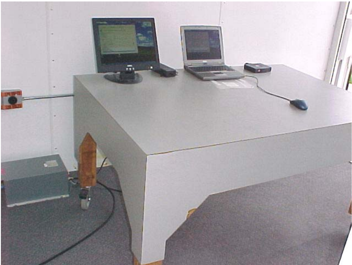
AC Conducted Emissions Measurement (Front View) Setup