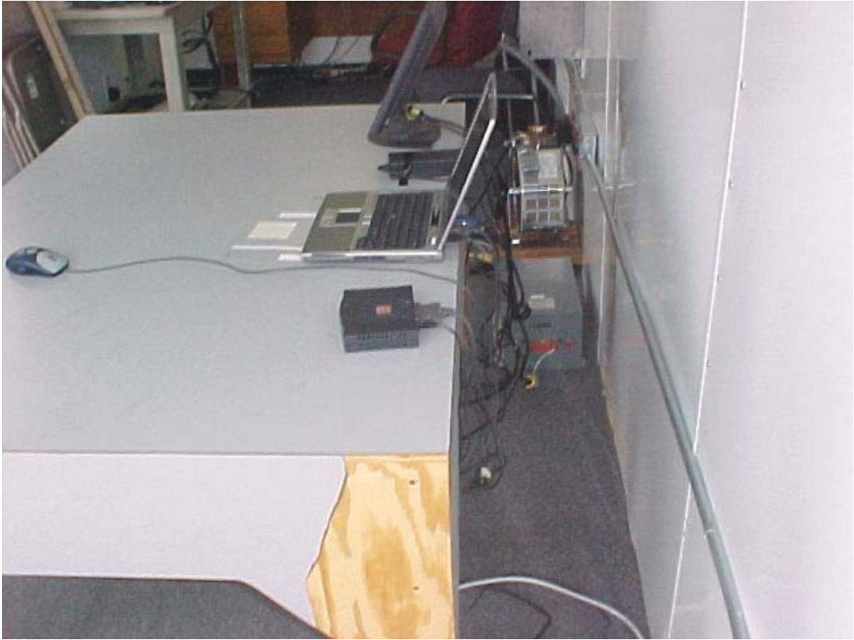
AC Conducted Emissions Measurement (Rear View) Setup