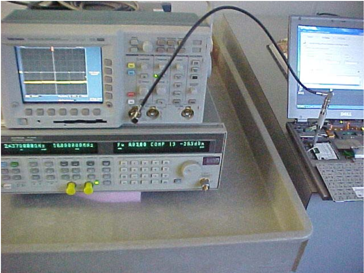
Maximum Peak Output Power Measurement Setup