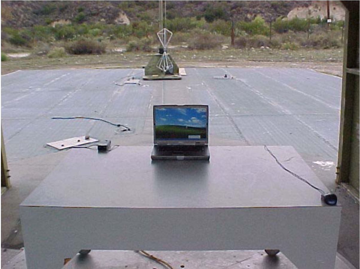
Radiated Emissions Measurement (30-1000 MHz) (Front View) Setup