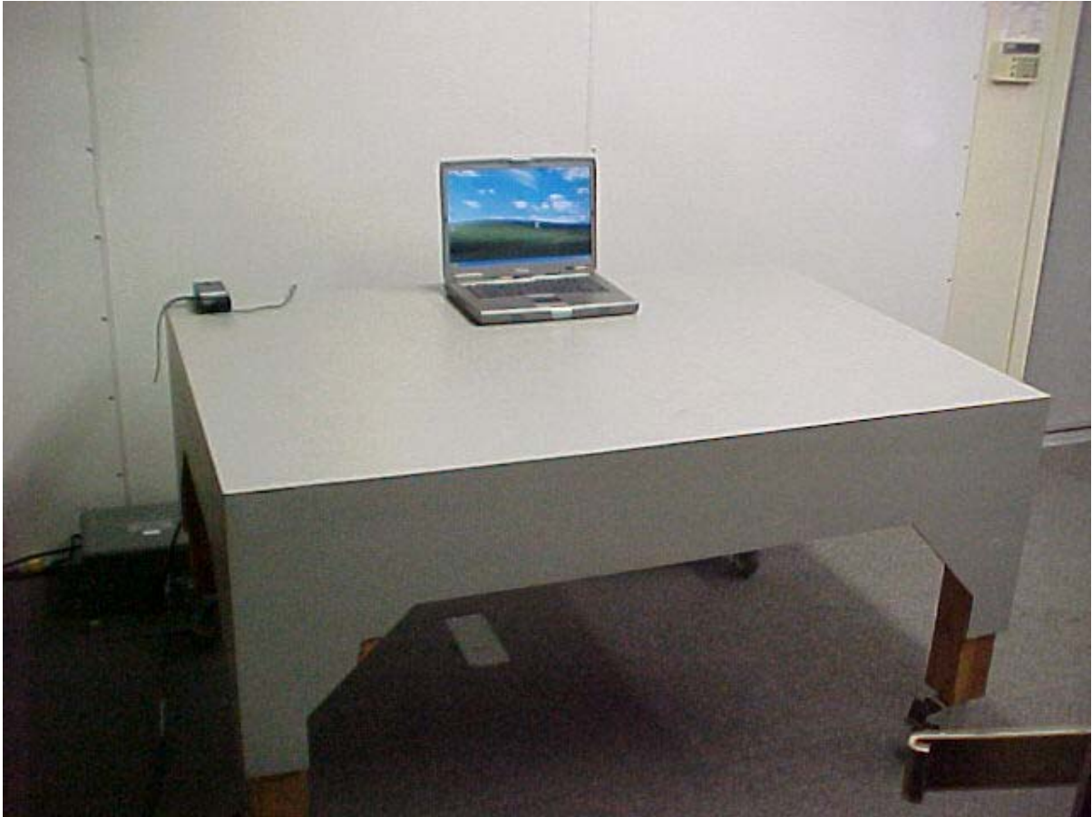
AC Conducted Emissions Measurement (Front View) Setup