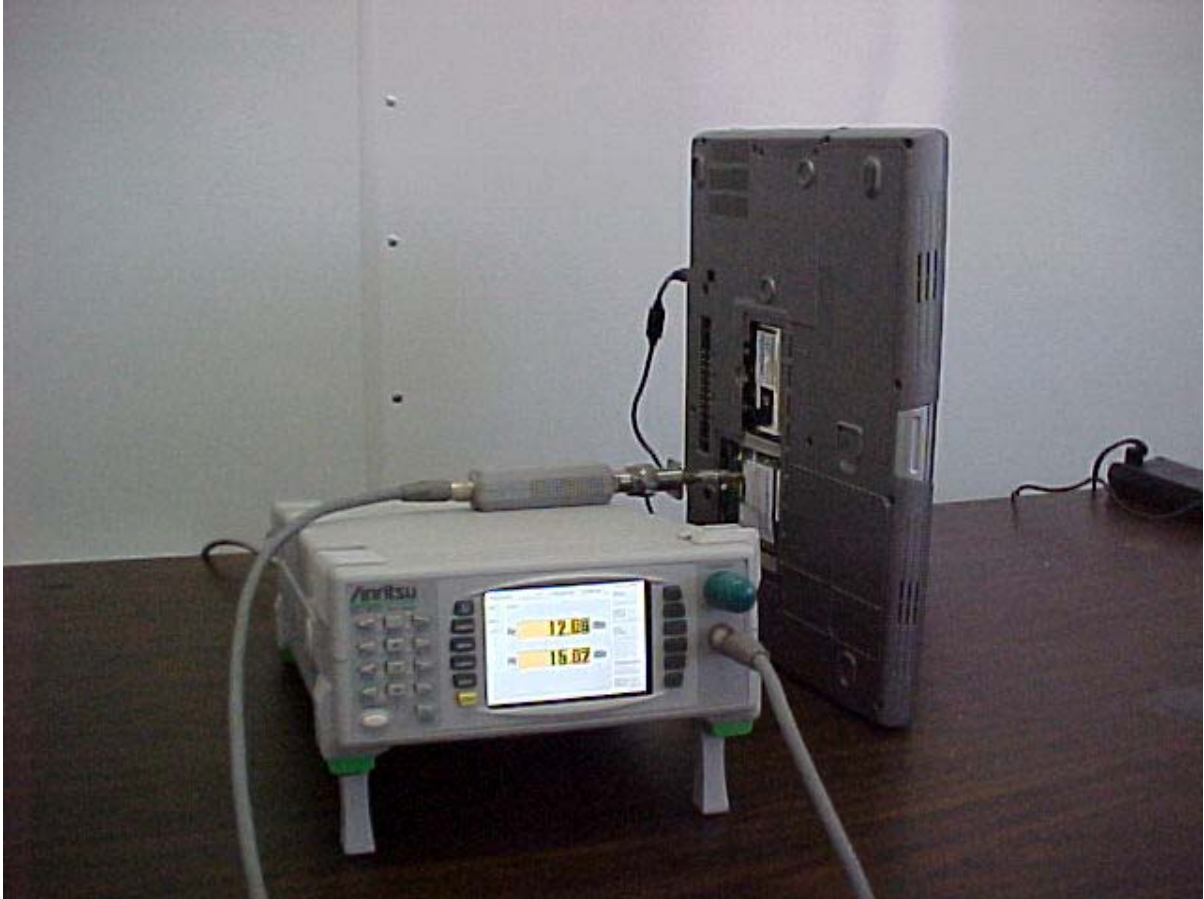
Maximum Peak Output Power Measurement Setup