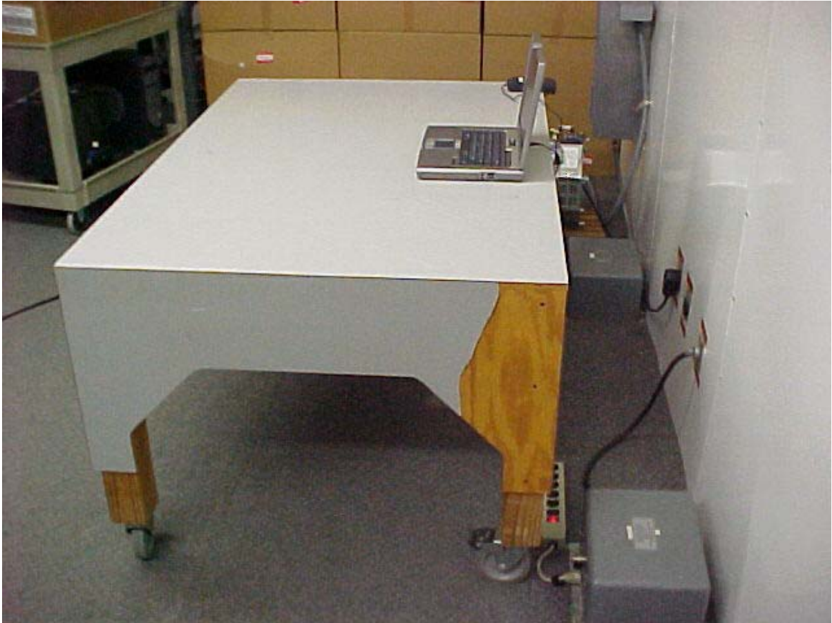
AC Conducted Emissions Measurement (Rear View) Setup