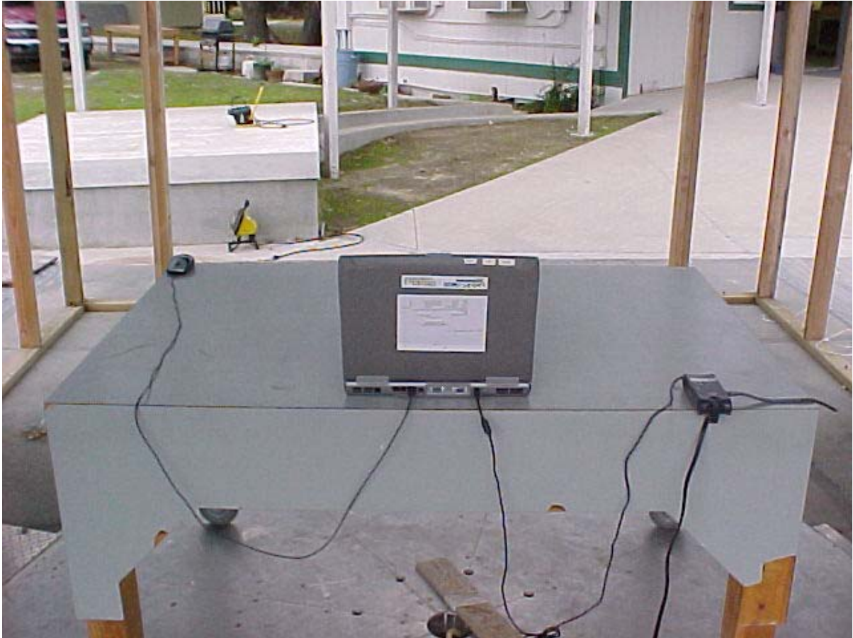
Radiated Emissions Measurement (30-1000 MHz) (Rear View) Setup