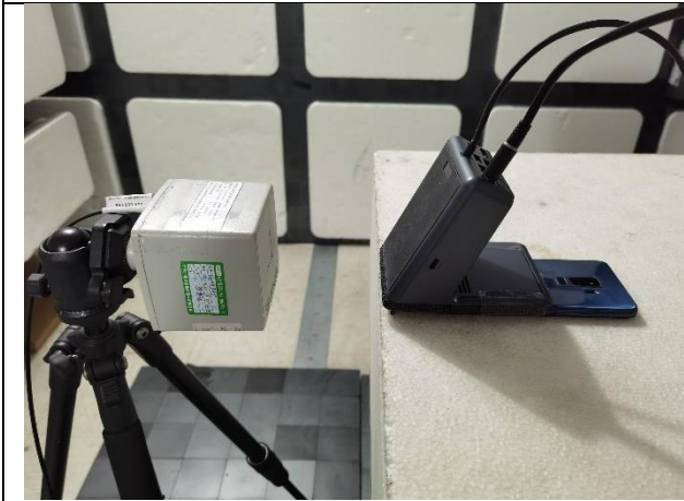
Position E_Top Coil