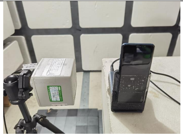
Position D_Top Coil