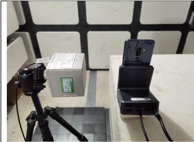
Position C_Top Coil