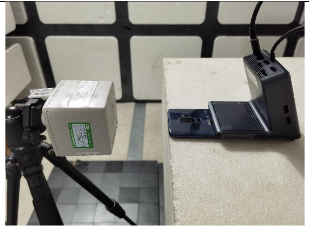
Position F_Top Coil