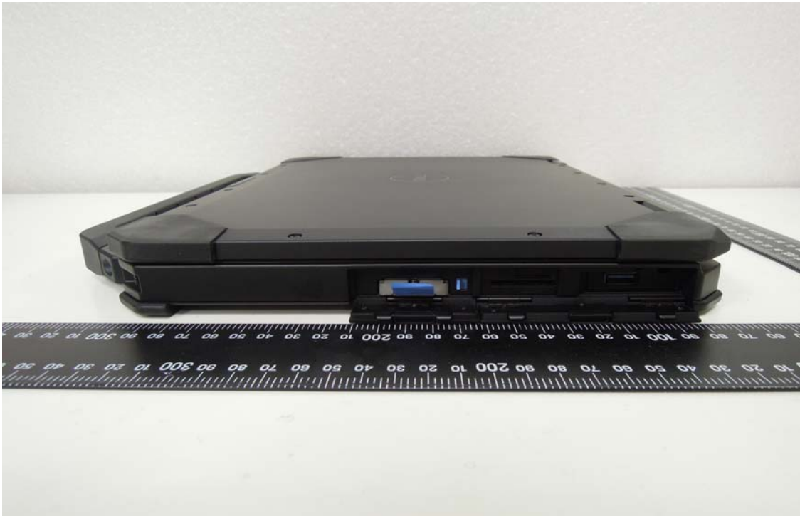
Side View of EUT – 6