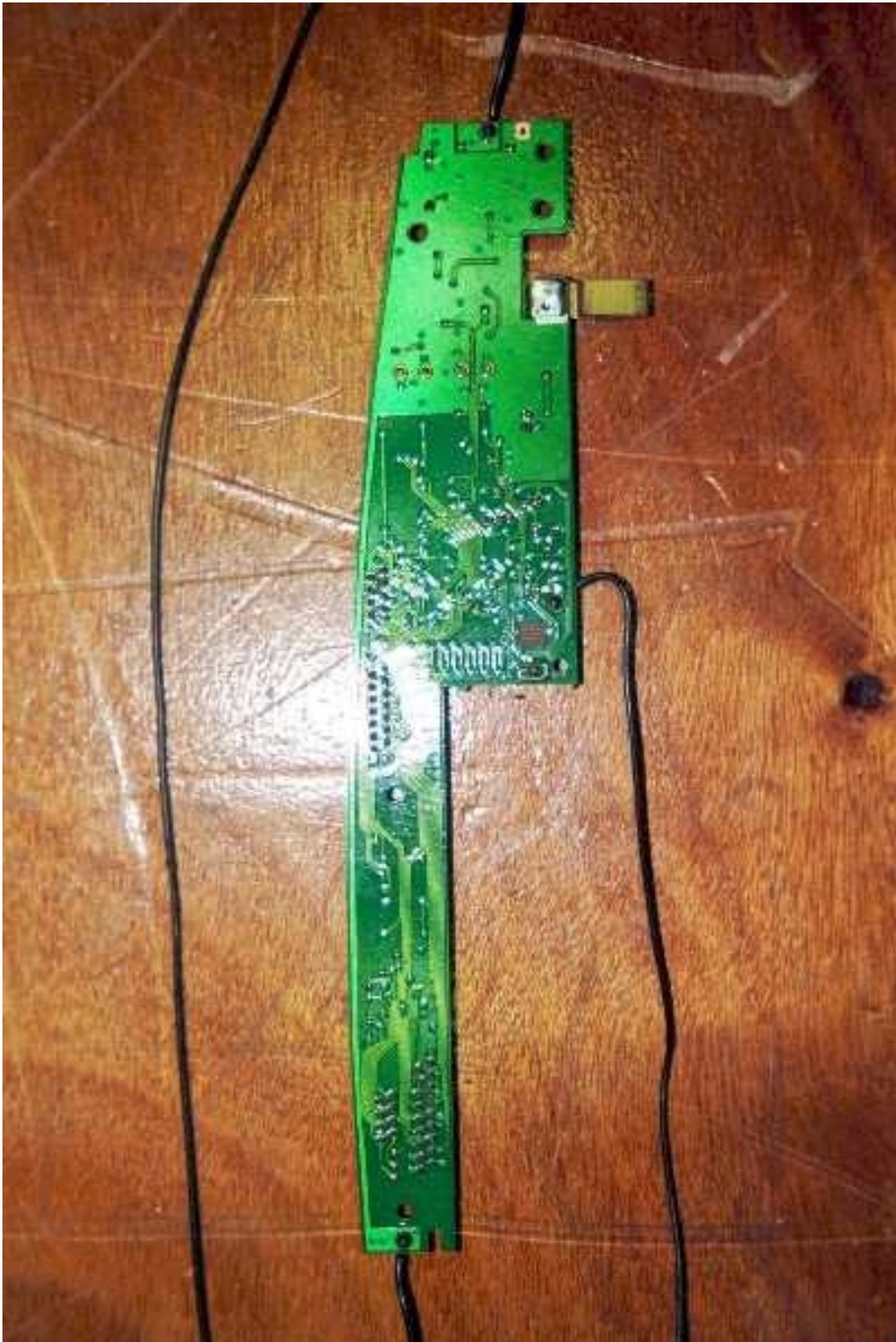
BOTTOM VIEW OF TRANSMITTER BOARD (Y-RE20)

ELECTRO MAGNETIC TEST, INC. 1547 Plymouth Street, Mountain View, CA 94043 Tel: (650) 965-4000 Fax: (650) 965-3000