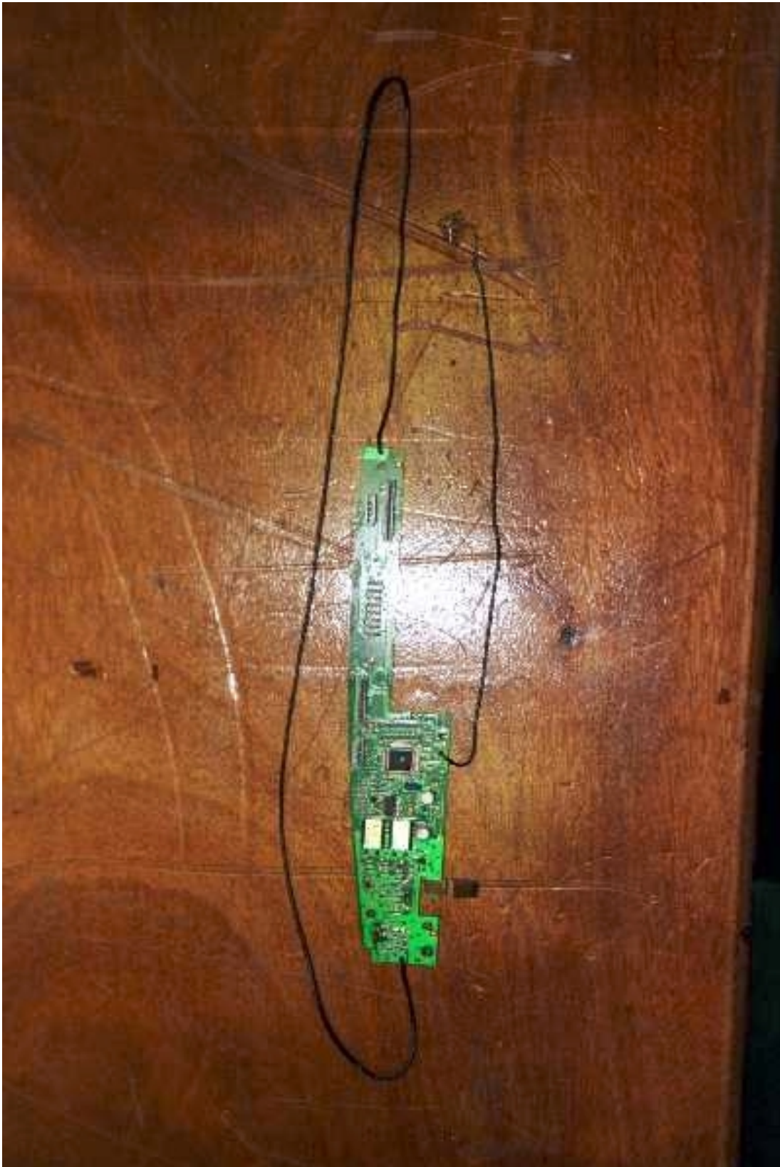
TOP VIEW OF TRANSMITTER BOARD/ANTENNA (Y-RE20)

1547 Plymouth Street, Mountain View, CA 94043 Tel: (650) 965-4000 Fax: (650) 965-3000