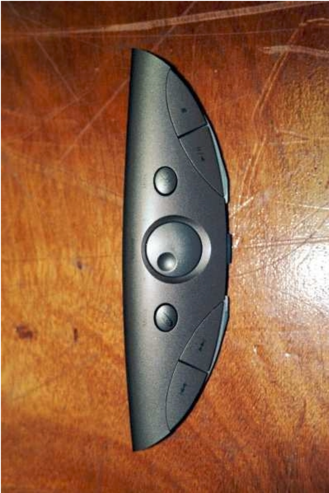
TOP VIEW OF VOLUME CONTROL ASSEMBLY (Y-RE20)

ELECTRO MAGNETIC TEST, INC. 1547 Plymouth Street, Mountain View, CA 94043 Tel: (650) 965-4000 Fax: (650) 965-3000