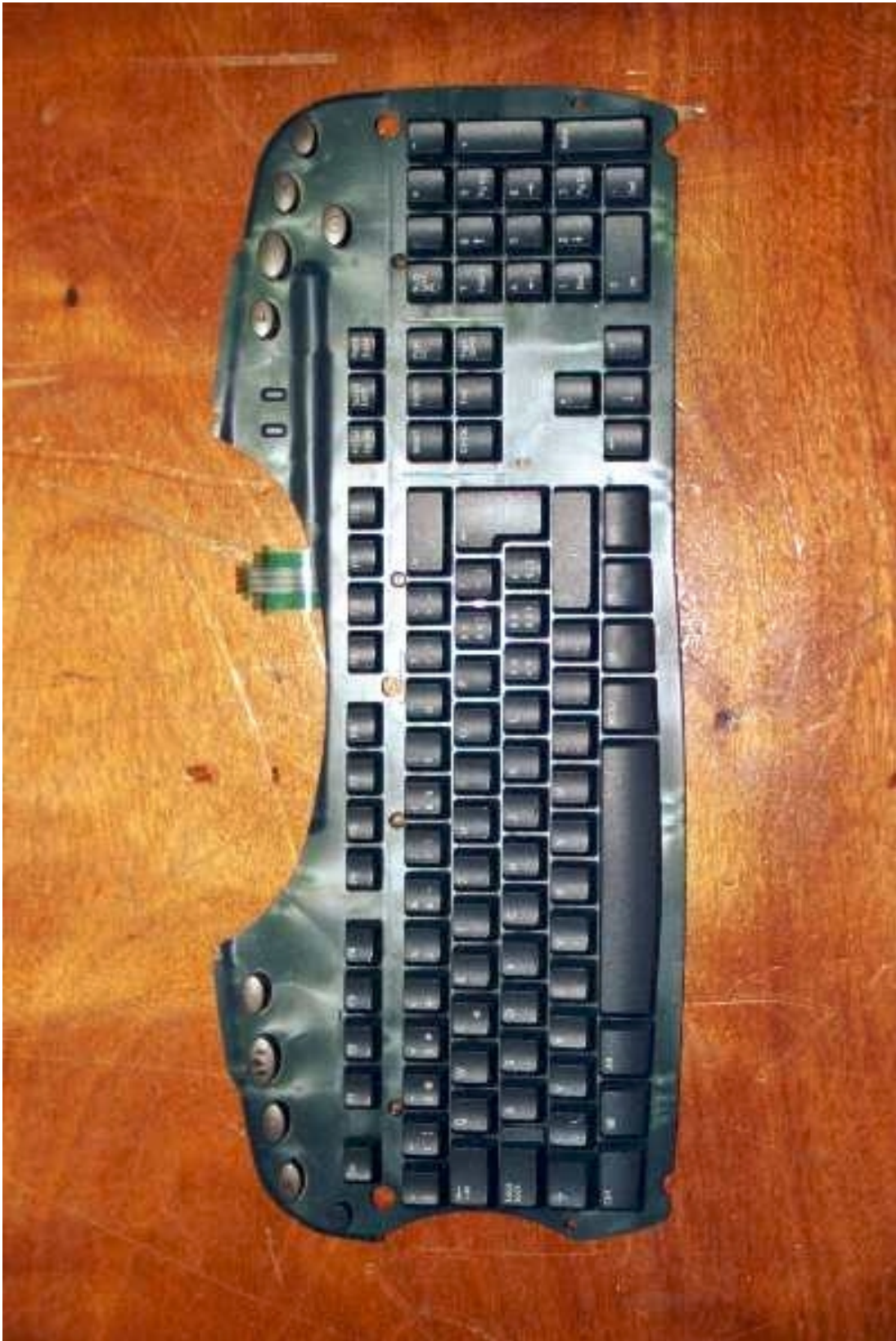
TOP VIEW OF EUT (PLASTIC COVER REMOVED) (Y-RE20)

ELECTRO MAGNETIC TEST, INC. 1547 Plymouth Street, Mountain View, CA 94043 Tel: (650) 965-4000 Fax: (650) 965-3000