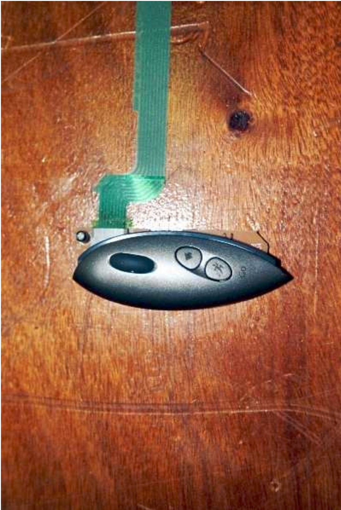
TOP VIEW OF MOUSE ASSEMBLY (Y-RE20)

ELECTRO MAGNETIC TEST, INC. 1547 Plymouth Street, Mountain View, CA 94043 Tel: (650) 965-4000 Fax: (650) 965-3000