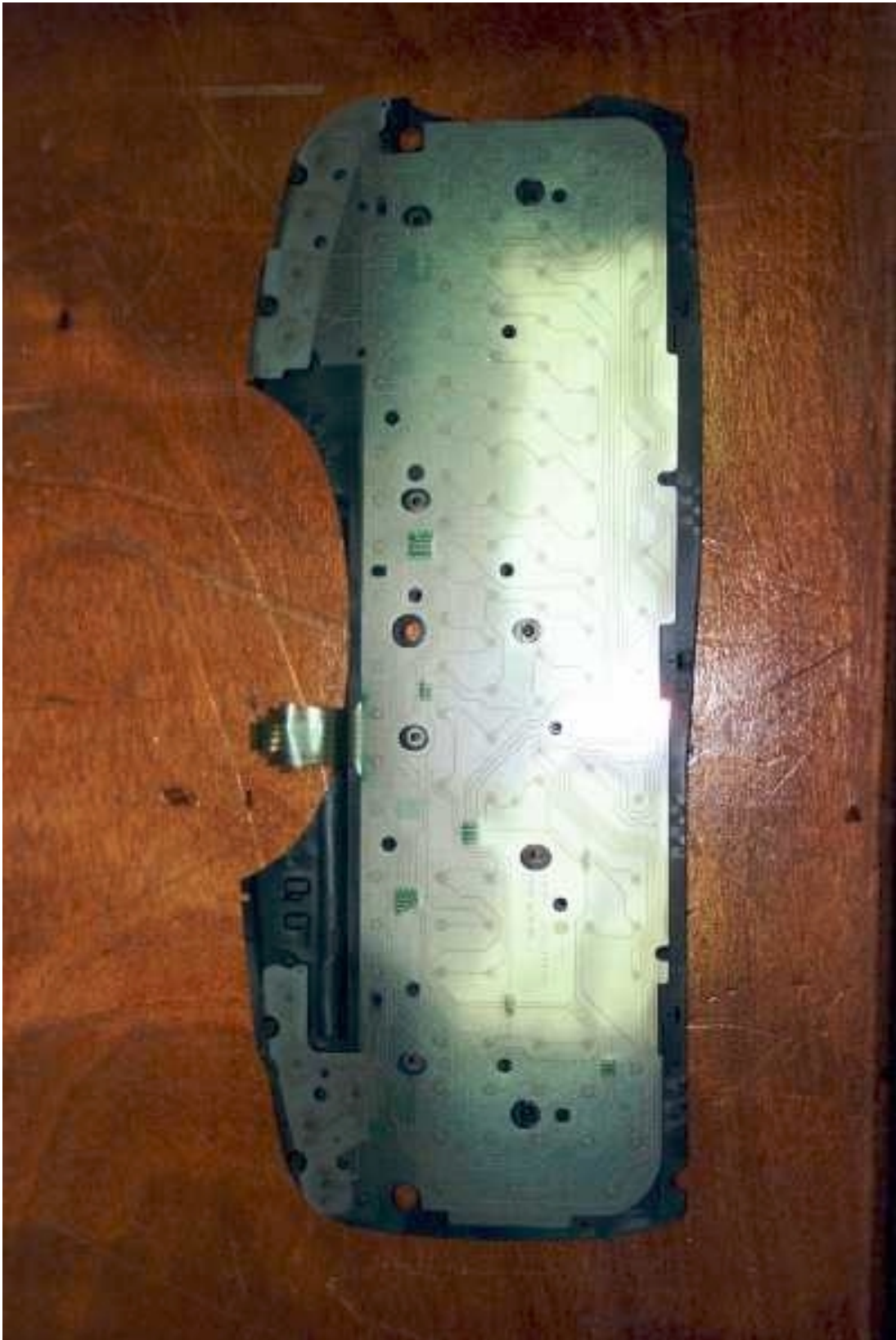
BOTTOM INSIDE VIEW OF EUT (METAL COVER REMOVED) (Y-RE20)

1547 Plymouth Street, Mountain View, CA 94043 Tel: (650) 965-4000 Fax: (650) 965-3000