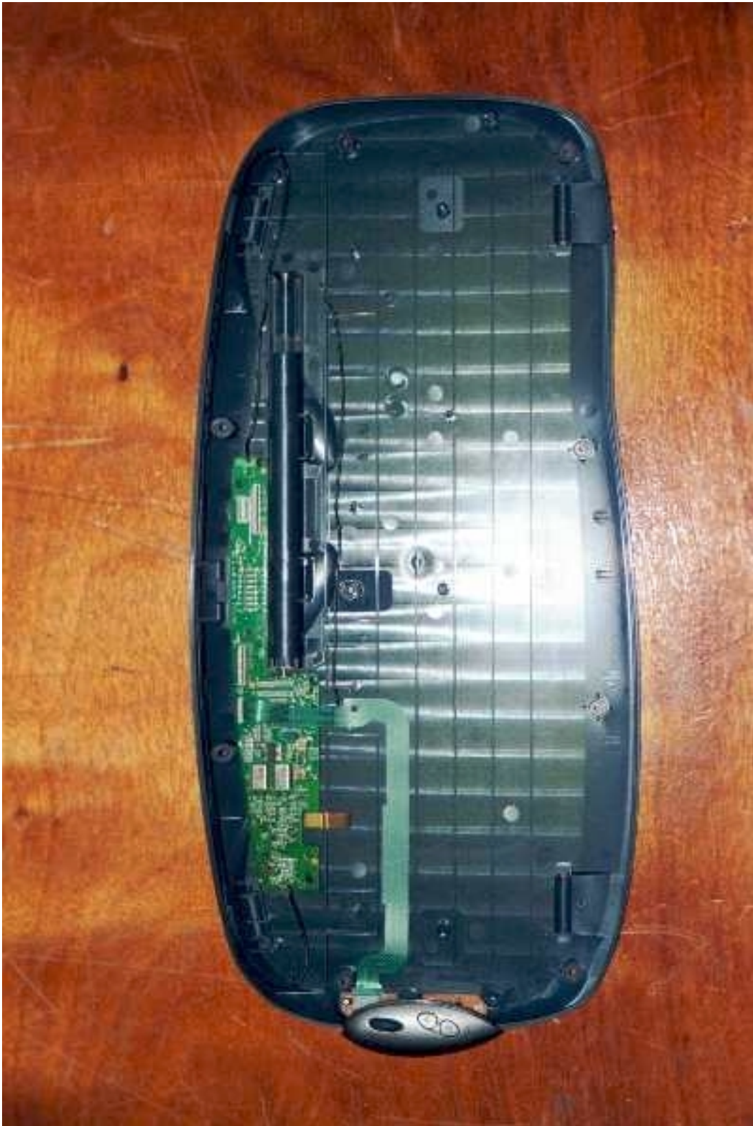
INSIDE VIEW OF BOTTOM HALF OF EUT (Y-RE20)

ELECTRO MAGNETIC TEST, INC. 1547 Plymouth Street, Mountain View, CA 94043 Tel: (650) 965-4000 Fax: (650) 965-3000