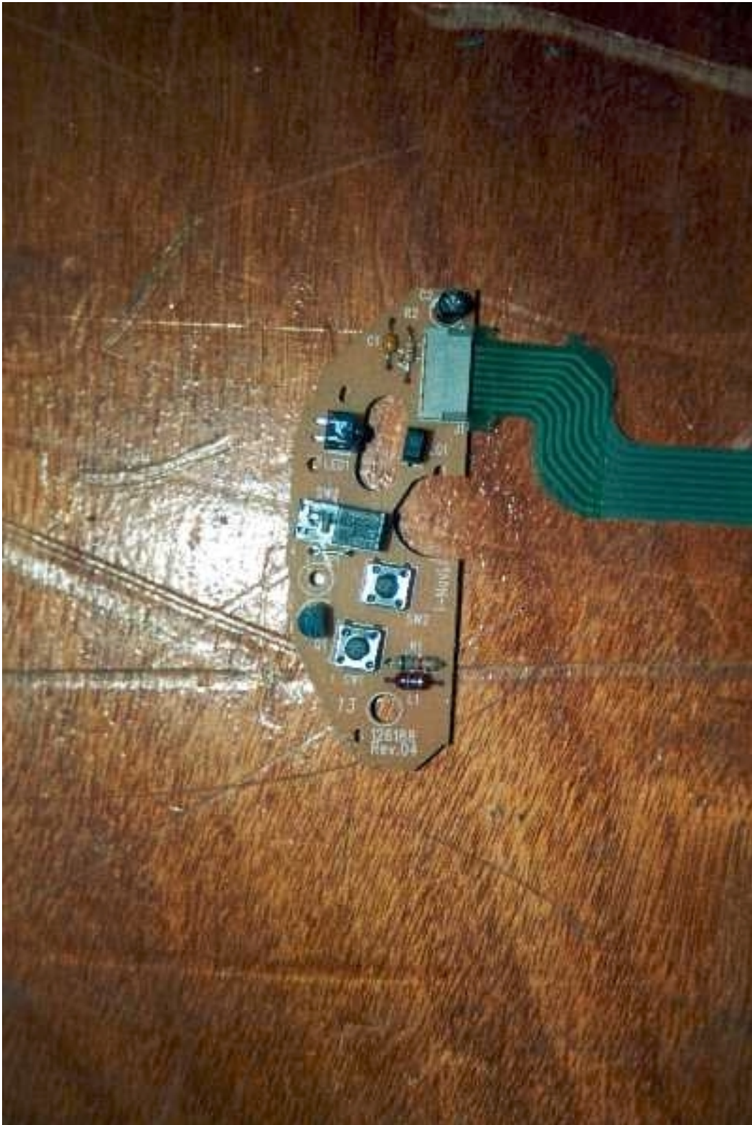
TOP VIEW OF MOUSE CIRCUIT BOARD (Y-RE20)

ELECTRO MAGNETIC TEST, INC. 1547 Plymouth Street, Mountain View, CA 94043 Tel: (650) 965-4000 Fax: (650) 965-3000