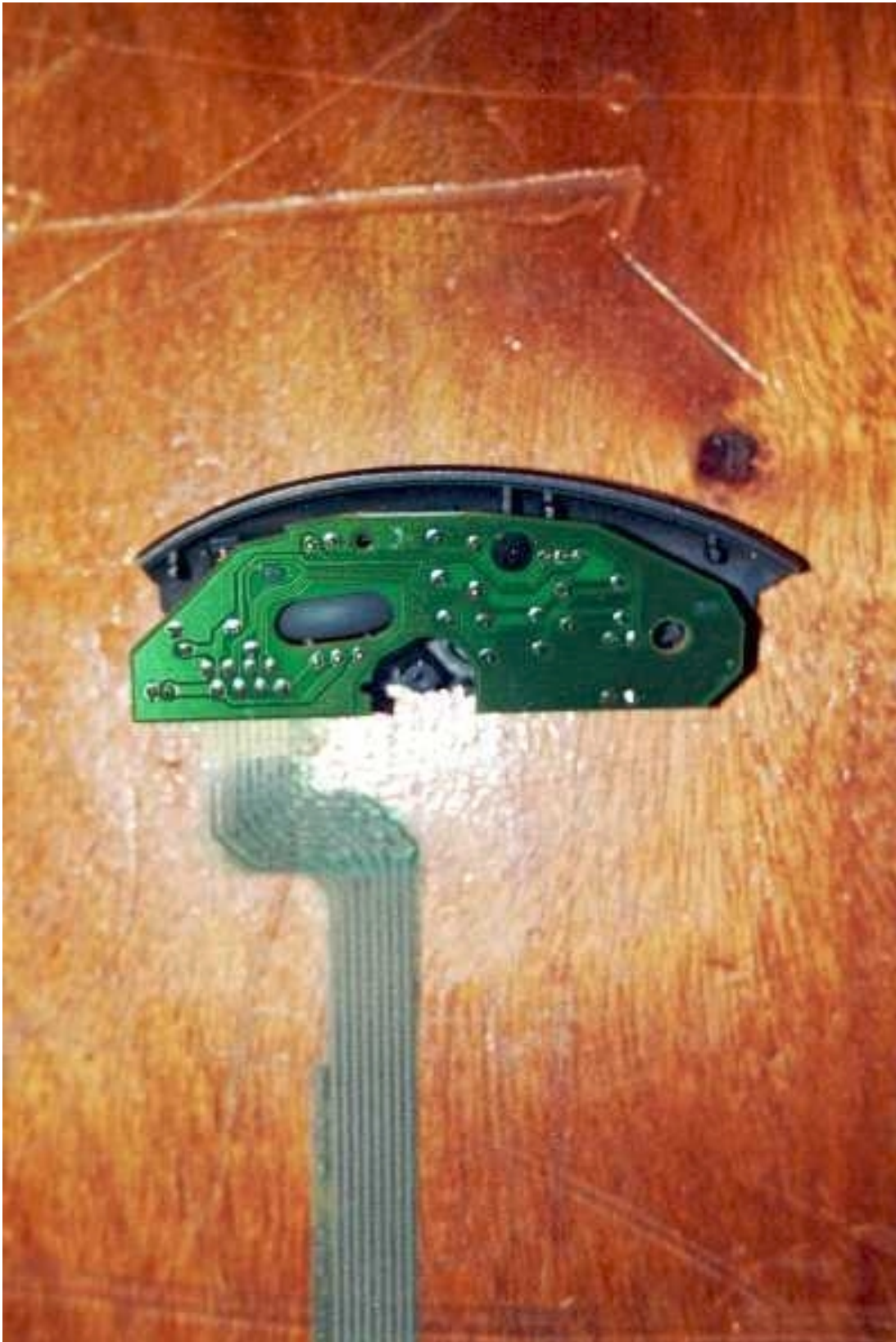
BOTTOM VIEW OF MOUSE ASSEMBLY (Y-RE20)

1547 Plymouth Street, Mountain View, CA 94043 Tel: (650) 965-4000 Fax: (650) 965-3000