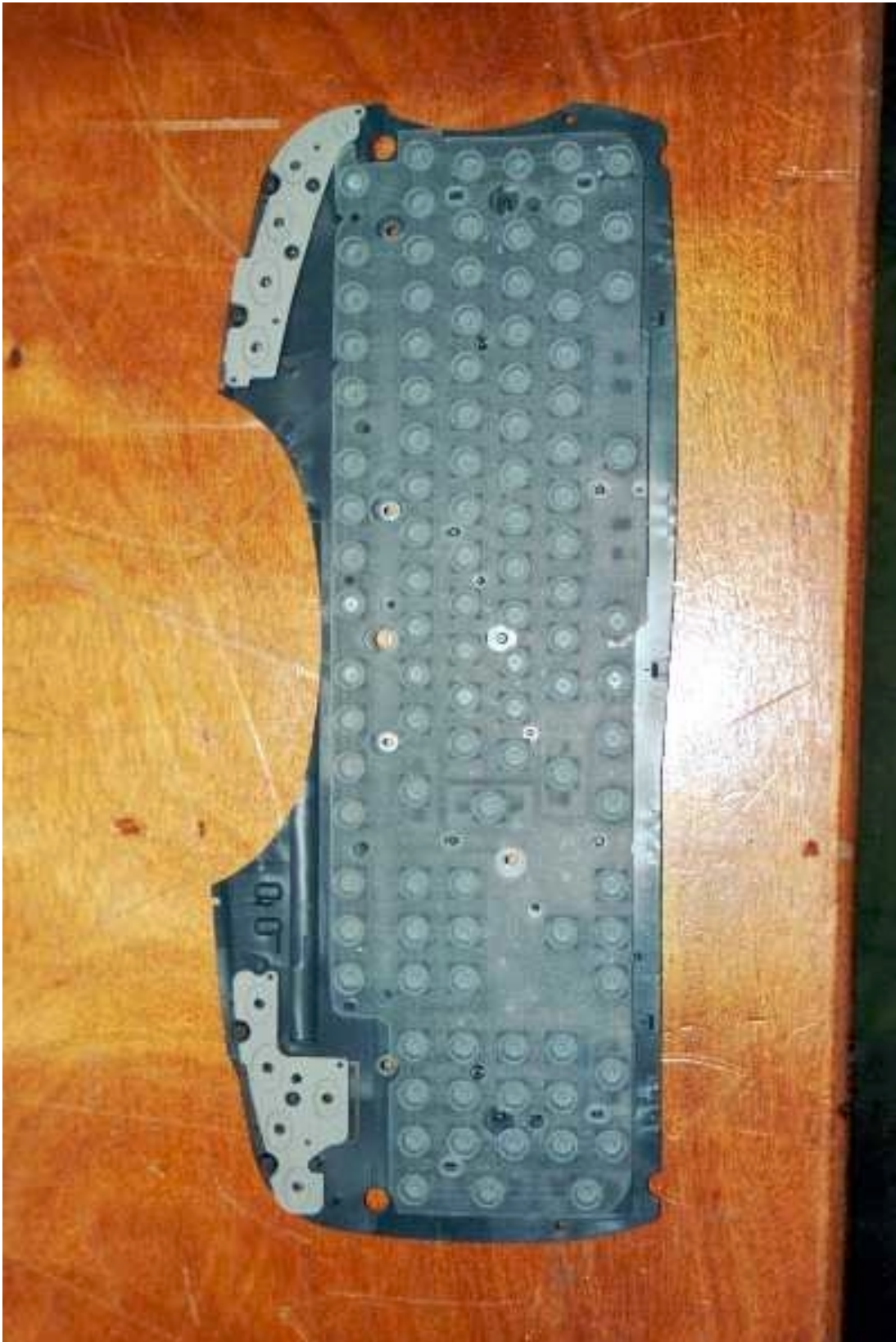
BOTTOM INSIDE VIEW OF EUT (CIRCUIT BOARD REMOVED) (Y-RE20)

ELECTRO MAGNETIC TEST, INC. 1547 Plymouth Street, Mountain View, CA 94043 Tel: (650) 965-4000 Fax: (650) 965-3000