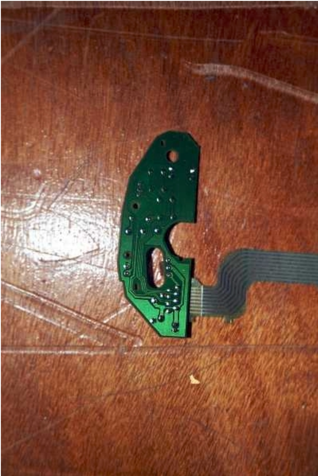
BOTTOM VIEW OF MOUSE CIRCUIT BOARD (Y-RE20)

ELECTRO MAGNETIC TEST, INC. 1547 Plymouth Street, Mountain View, CA 94043 Tel: (650) 965-4000 Fax: (650) 965-3000