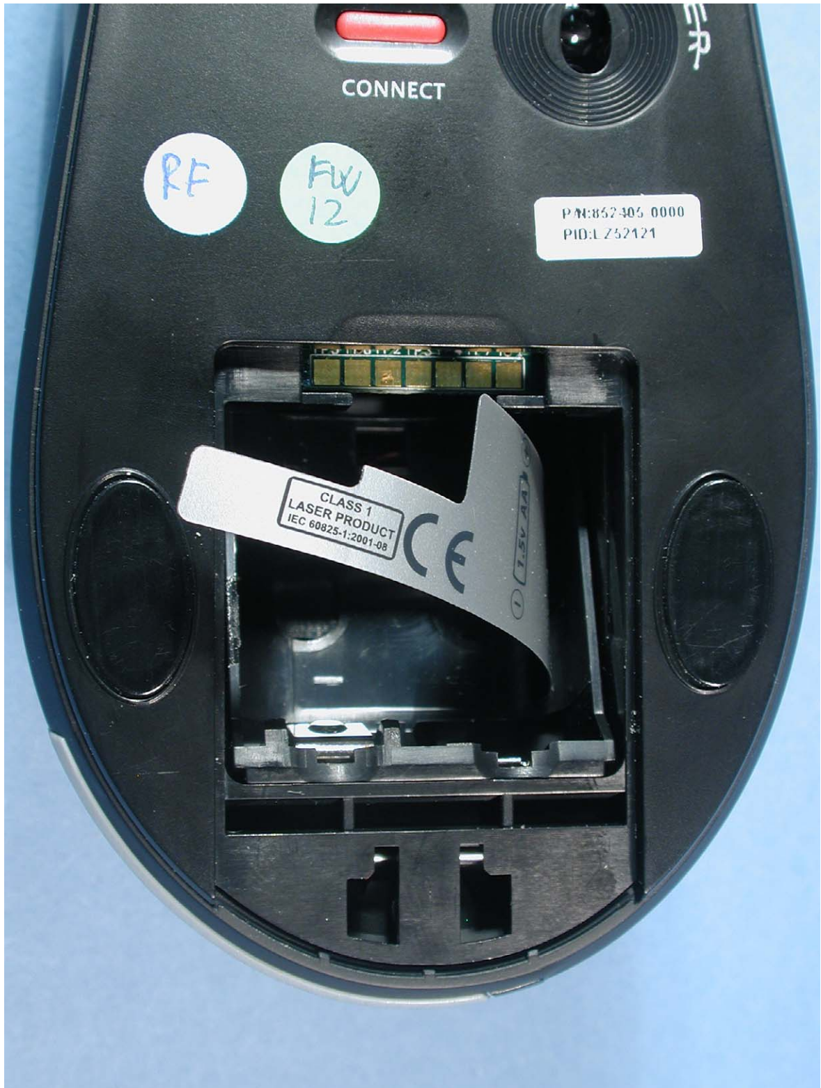
Photograph 3: Battery compartment of M-RAZ105