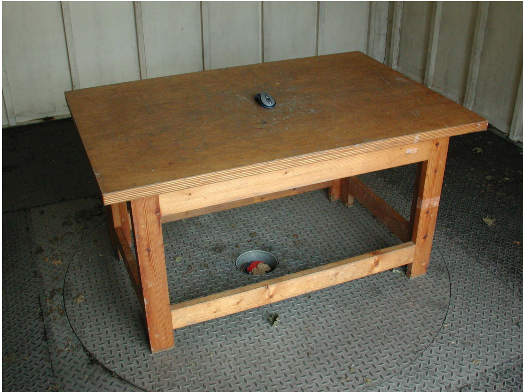
Photograph page 1: Test set up M-RAM99: on turntable