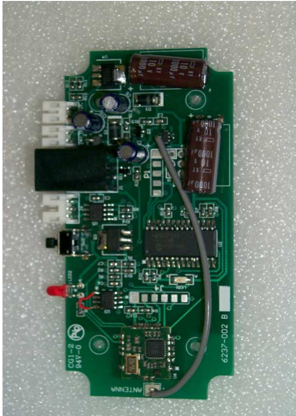
7.4 PCB Component View