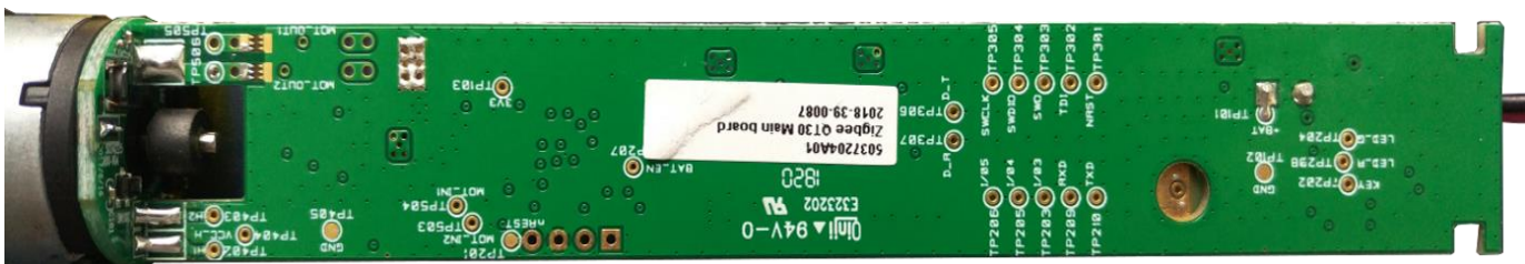
PCB Foil Side