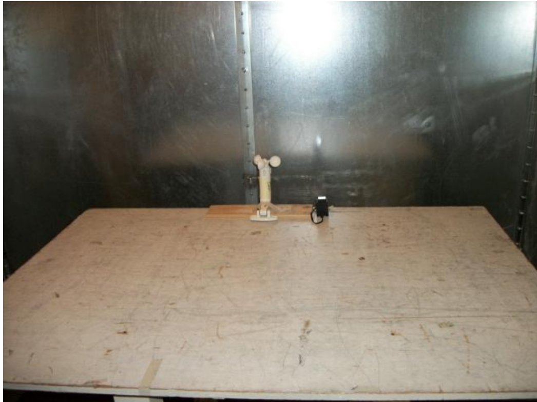
Figure 3.2 Conducted Setup- Front