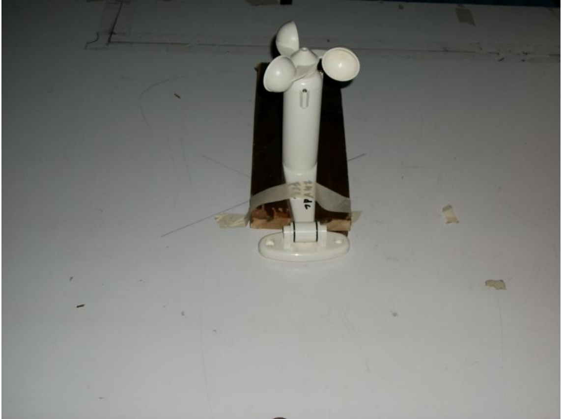
Figure 3.1 Radiated Test Setup