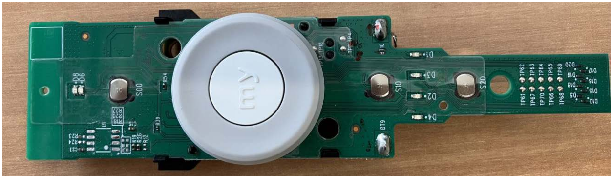
EUT- Foil Side Top View