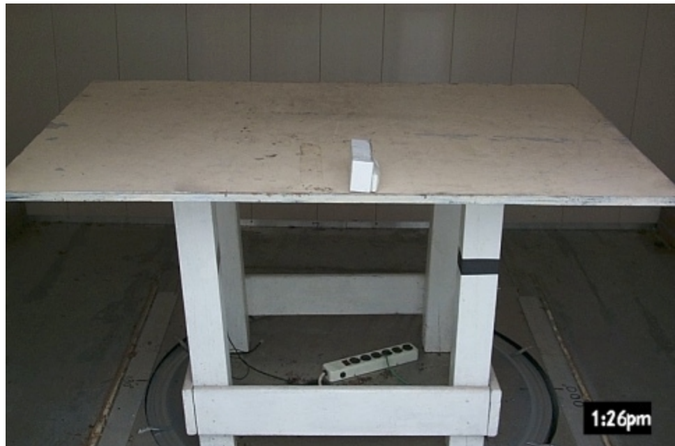
Figure 3.2 Radiated Test Setup, Position 2