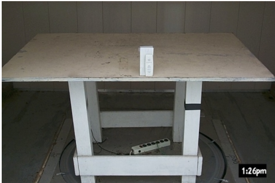
Figure 3.3 Radiated Test Setup, Position 3