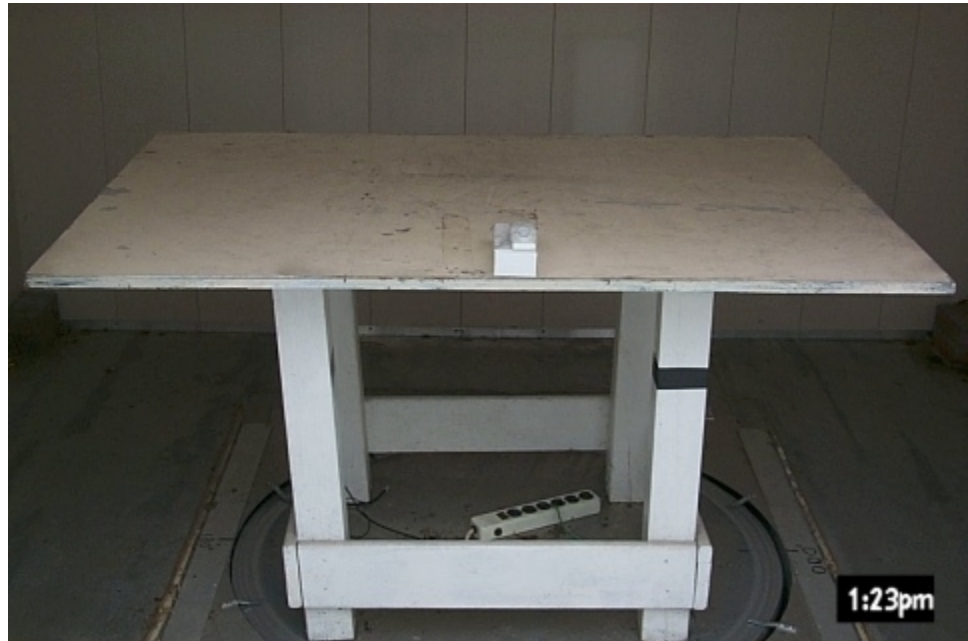
Figure 3.1 Radiated Test Setup, Position 1