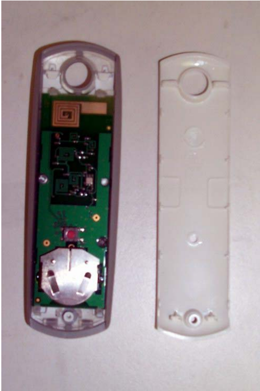
Figure 7.3 Open View