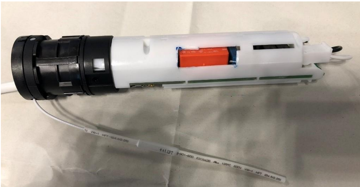
Cover open, Inside View