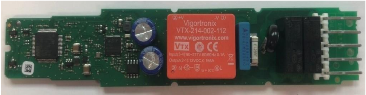
PCB Components Side