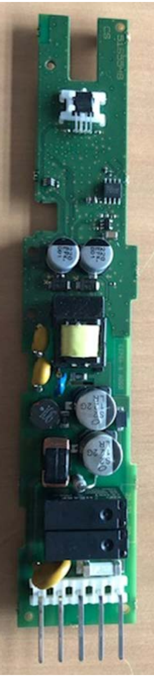
PCB Components Side 01